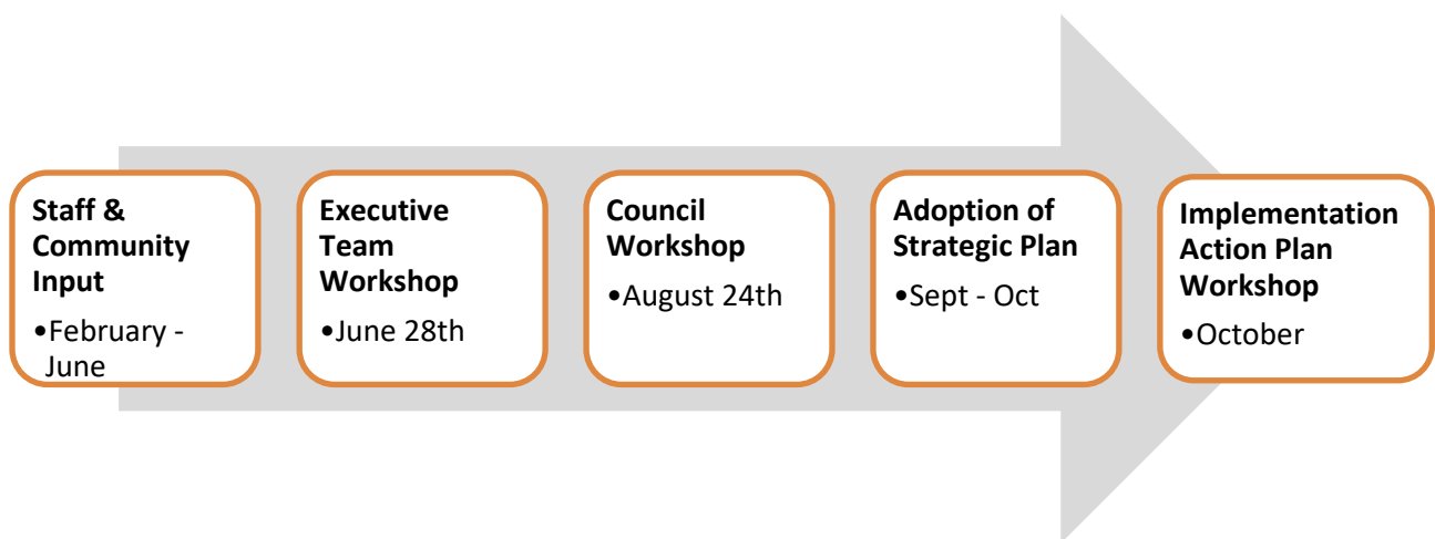
Figure 1. Strategic Planning Process Timeline

In February 2023, as shown in the figure below, staff began the information gathering phase of the strategic plan. This phase involved participation from the City Council, City staff, and the Pleasanton community.