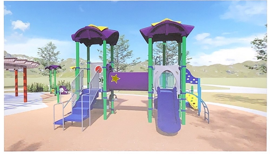
Val Vista Community Park Design Option 1 2-5 Play Area