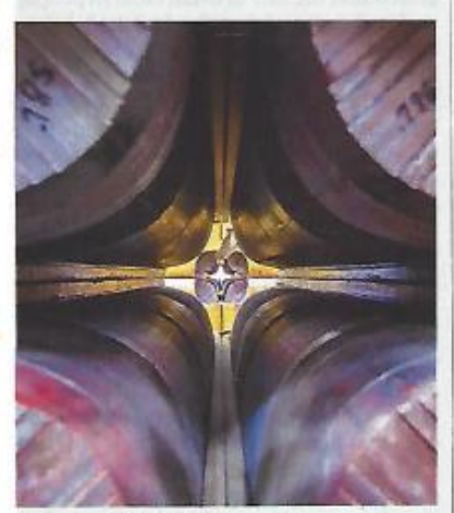
A magnetic moment

Establishing the muon's nature was. though, an important part of the creation of what is known as the Standard Model of particle physics. This, along with Einstein's general theory of relativity (actually a theory of gravity), is one of the two foundation stones on which modern physics is built. Yet the Standard Model is known to be incomplete for several reasons, one of which is precisely the fact that it does not yet embrace gravity. So it seems fitting that an answer to Rabi's question, and with it a path to an explanation of physics beyond the Standard Model, may now have been opened