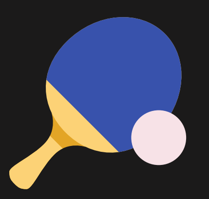
TABLE TENNIS RENTALS & LESSONS