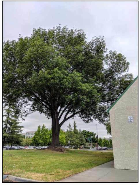
Photo 4 – Evergreen ash #1 was one of the largest trees assessed with a trunk diameter of 44".