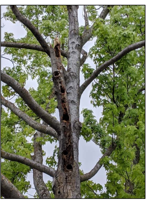
Photo 1 – Sweetgum #70 had a dead branch with European starlings nesting in cavities.

Twenty-nine (29) evergreen pears were included in the assessment (18% of population). The evergreen pears were in fair (17 trees) to poor (10 trees) condition with two trees in good condition. They had an average trunk diameter of 12" and ranged from 5 to 21" in diameter. The pears in good condition had dense, wide spreading crowns (Photo 2). The pears in poor condition had poor form and structure.