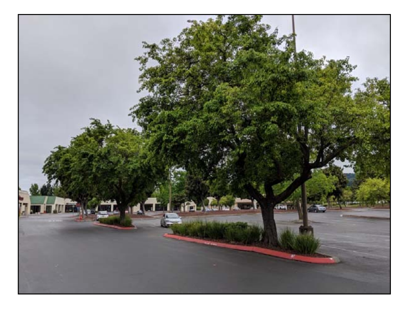
Photo 2 – Evergreen pears #45 and 46 were in good condition with dense, wide-spreading crowns.