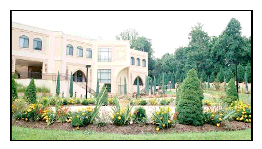
Landscaping at the MTO Virginia Facility

Entrance to the facility would gained through ornate wrought iron gates, while the surrounding fencing would typically be wrought iron, stone wall, or a combination of the two. The Fire Marshall has required a minimum 40-foot setback of the main gate from Dublin Canyon Road to allow safe stacking of vehicles without impeding traffic flow.