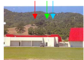
Lot 1= red, Lot 2= green, and Lot 3= blue (existing structures)

The applicant has proposed a low-profile, 22-foot tall, house on Lot 2 to minimize its visual impact from the valley floor. Staff also believes that the earth tone colors proposed for Lot 2 will further help to make the home less visible amongst the wooded area. Staff feels that the visual impacts of this home will be mitigated adequately with the proposed measures and conditions of approval.