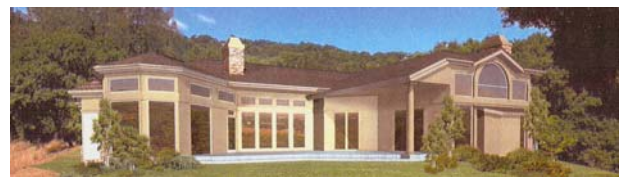
Rendering of the recently constructed home on Lot 1 (rear elevation)