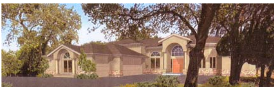
Rendering of the recently constructed home on Lot 1 (front elevation)