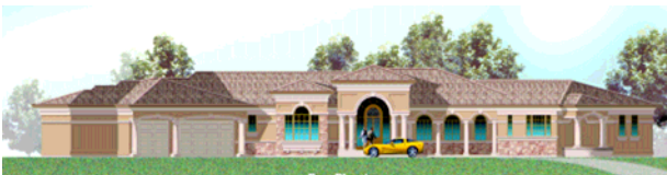
Rendering of the proposed home on Lot 2 (front elevation)

The approved PUD guidelines incorporate similar material guidelines found in the WFRCOD. However, the approved guidelines specify that building materials are limited to natural materials, such as wood siding and natural stone, and that stucco siding is allowed only if the elevations generously contain other natural materials such as wood siding and natural stone. Regarding the design of the Lot 2 house, staff believes that the architectural style of the house is compatible with its setting. The proposed house would have stucco walls with a stone wainscot. Staff believes that the stucco wall material is acceptable for Lot 2 since the proposed house has a low-profile design, it incorporates stone wainscoting, and the recently constructed home on the neighboring lot (Lot 1) is similar in style (see renderings shown below). Additionally, this lot is not highly visible from Foothill Road or the valley floor and uses darker earth tone body and roofing colors.