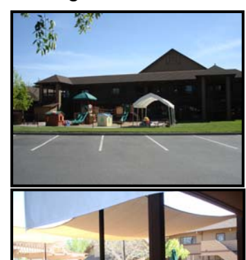
Play area between sanctuary building and parking lot