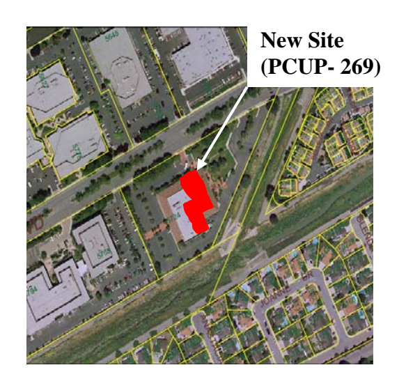
Figure 1.1: Site Layout

Tassajara Creek and Arroyo Mocho border the parcel on the east and south respectively, and professional/ commercia/ industrial service offices are to the north and west. There are residential developments located beyond the arroyo and creek to the east and south. The subject site is in proximity to Hart Middle School (across West Las Positas Blvd to the west).