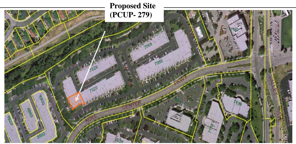
Figure1.1: Site Layout

The subject site is a 52,854-square-foot parcel located on the north side of Koll Center Parkway, west of Valley Avenue, within the Bernal Corporate Park development.