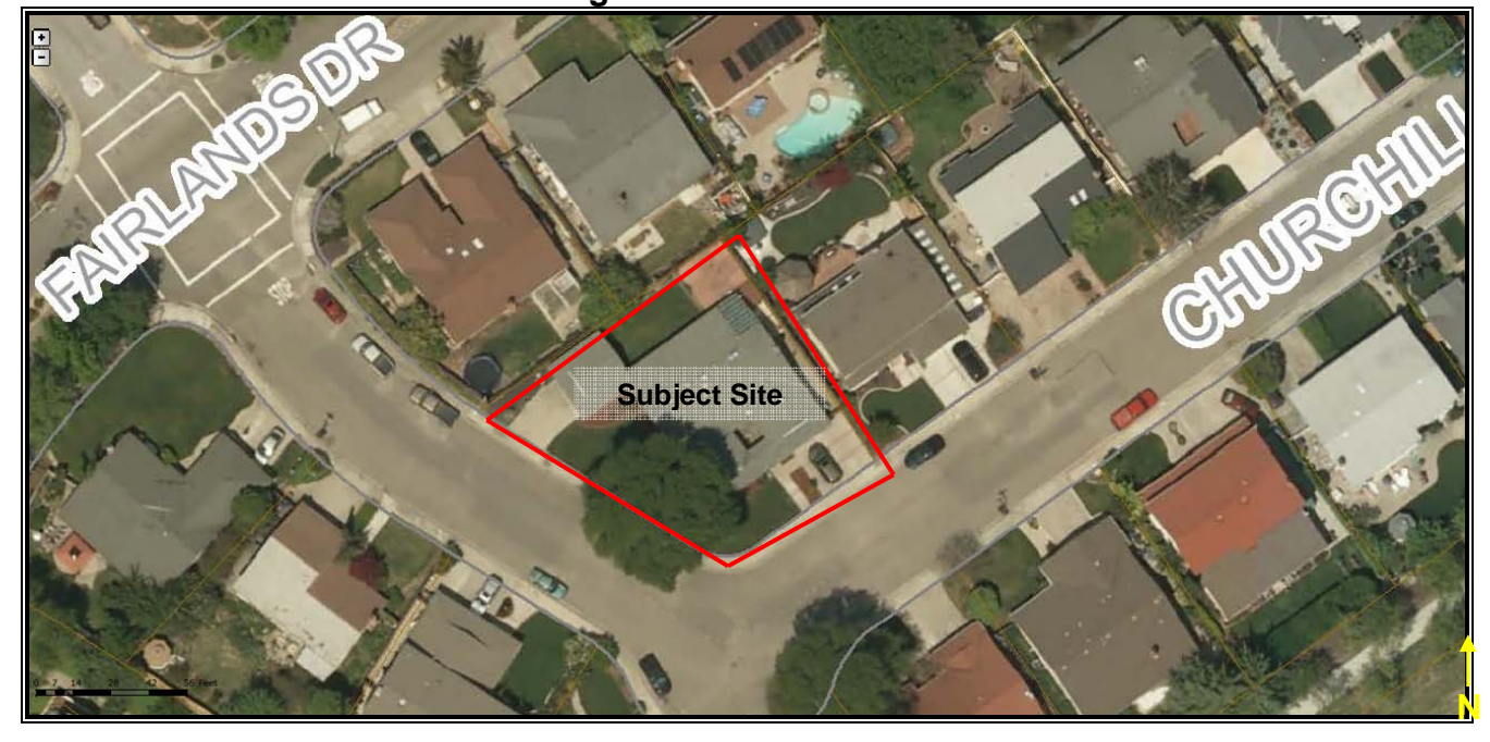
Figure 2: Focused View