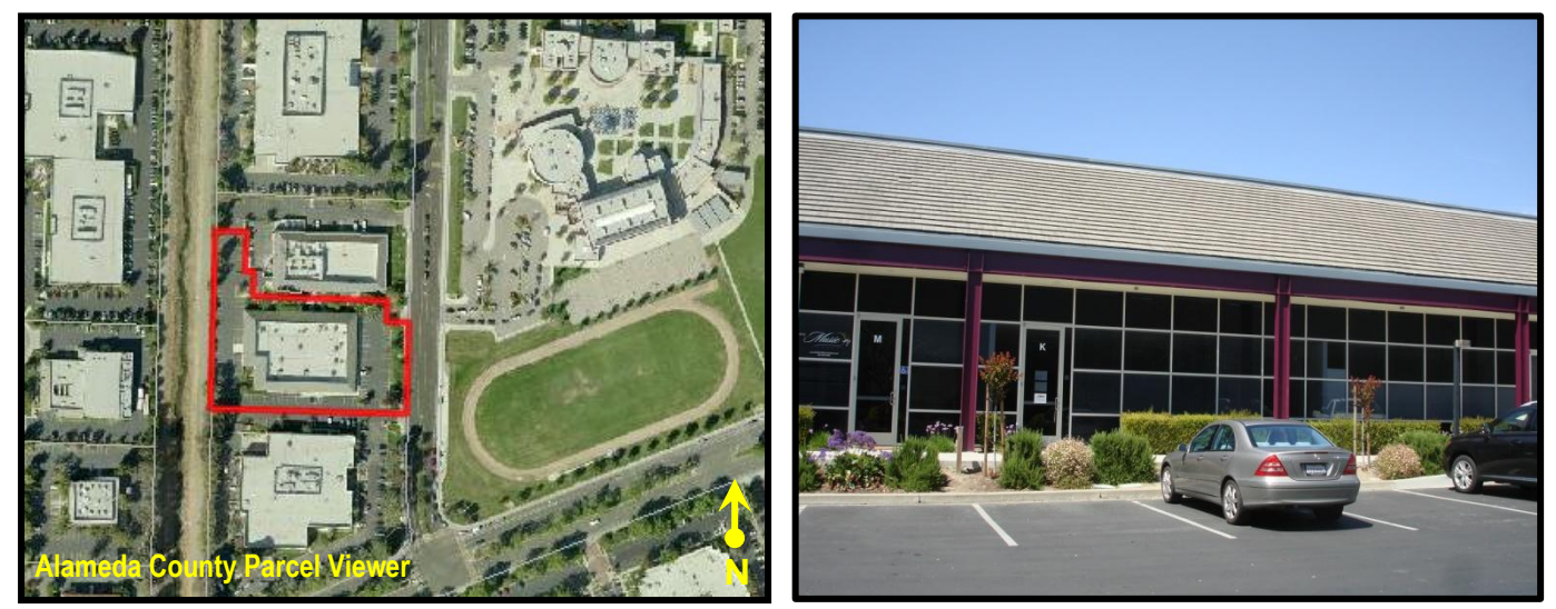
FIGURE 1: AERIAL PICTURE OF SUBJECT PROPERTY AND PHOTOGRAPH OF SUBJECT SUITE

subject site and are also located across the Chabot Canal to the west. Thomas Hart Middle School is located across Willow Road to the east. Figure 1 below shows photos and an aerial view of the area surrounding the subject building.