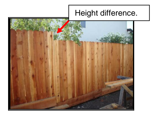
Picture of the fence from 3647 Glacier Court North (Mr. Baker's site)