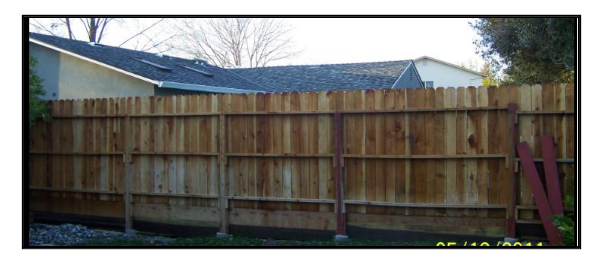
Picture of the fence from 3633 Glacier Court North (Mr. Pretzel's site)