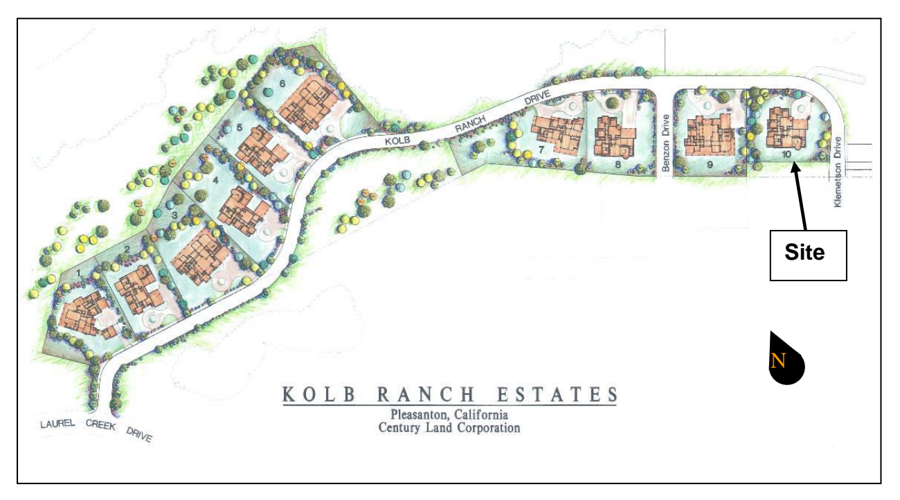
Figure 1: Custom Home Approved Layout Scheme (PDR-446)

In 2005, Hamid Taeb applied for and received design review approval to construct semicustom homes on Lots 1-10 (PDR-446) of the Kolb Ranch Estates. The 2005 Planning Commission Resolution, Staff Report, and meeting Minutes are attached for your reference as Exhibits C, D, and E, respectively.