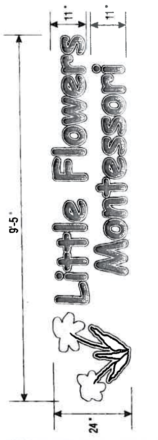
2 Elevation View Scale: 1/2"=1' Qty. 1