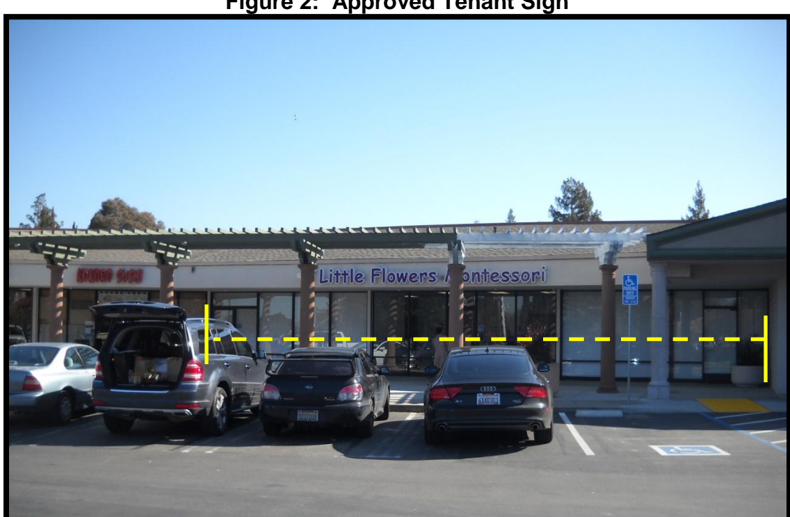
Figure 2: Approved Tenant Sign

Little Flowers Montessori received approval to install one 18-inch tall, 22-foot 5-inch long, internally illuminated sign above the child care center. Please refer to Figure 2 below for the photograph of the approved sign. The applicant is requesting to retain the 2-foot tall, 9-foot, 5-inch long, double stacked, non-illuminated, wall-mounted sign located adjacent to Little Flower Montessori's main tenant entrance. Although the applicant shares a common wall with the adjacent use, Anytime Fitness, the portion of the wall where the sign is located is on a portion of Anytime Fitness's wall that is not a shared wall. Please refer to Figure 3 on page 4 for the picture of the wall-mounted sign and its location.