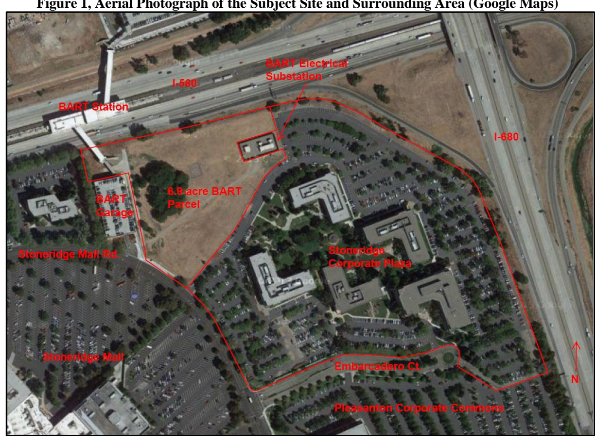
Figure 1, Aerial Photograph of the Subject Site and Surrounding Area (Google Maps)