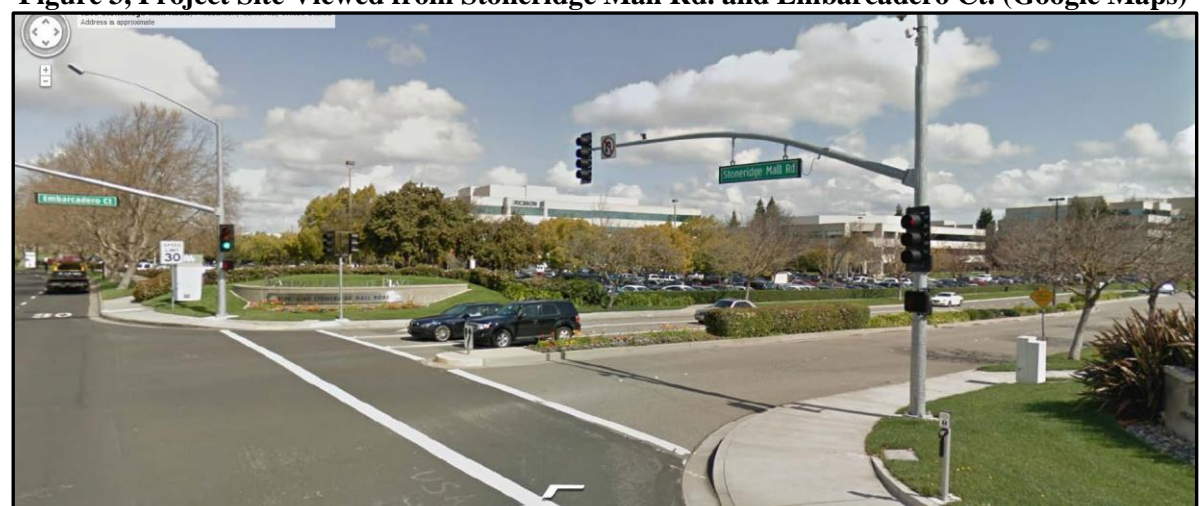
Figure 3, Project Site Viewed from Stoneridge Mall Rd. and Embarcadero Ct.