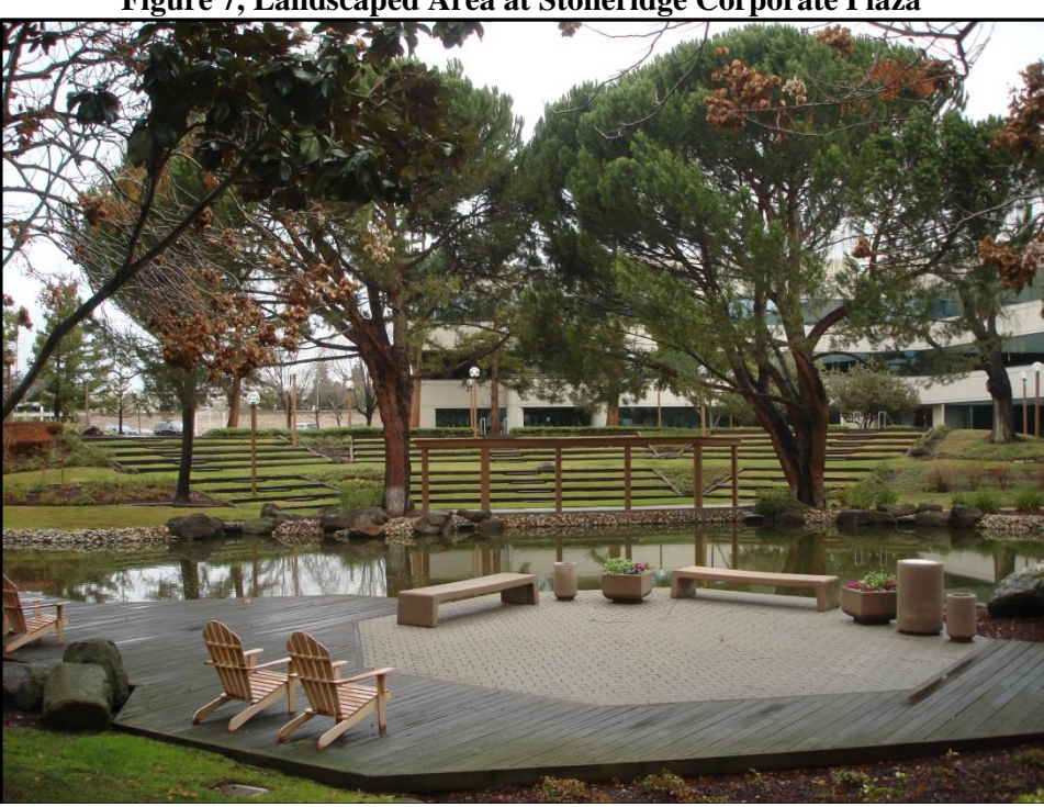
Figure 7, Landscaped Area at Stoneridge Corporate Plaza