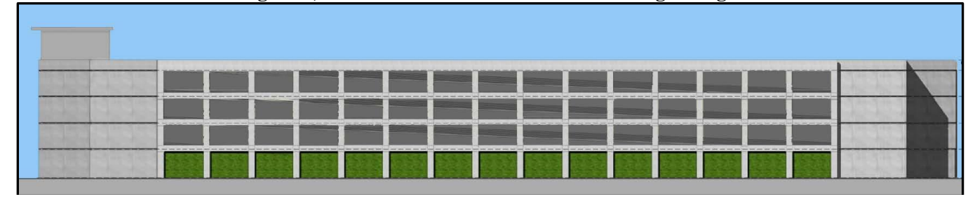
Figure 5, North Elevation of the 5-Level Parking Garage

• The five-level parking garage next to I-580 would have a maximum height of approximately 61 feet as measured at the top of the elevator penthouse and approximately 47 feet at the top of the parapet/guardrail. Elevations for the four-level parking garage have not been provided at this time. However, the conceptual design of the structure is provided on the birdseye views and it is assumed it would look similar to the five-level parking garage.