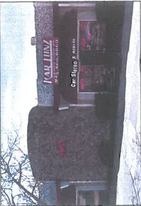
Existing Frontage, Will add 2'x2' Dealer Sign