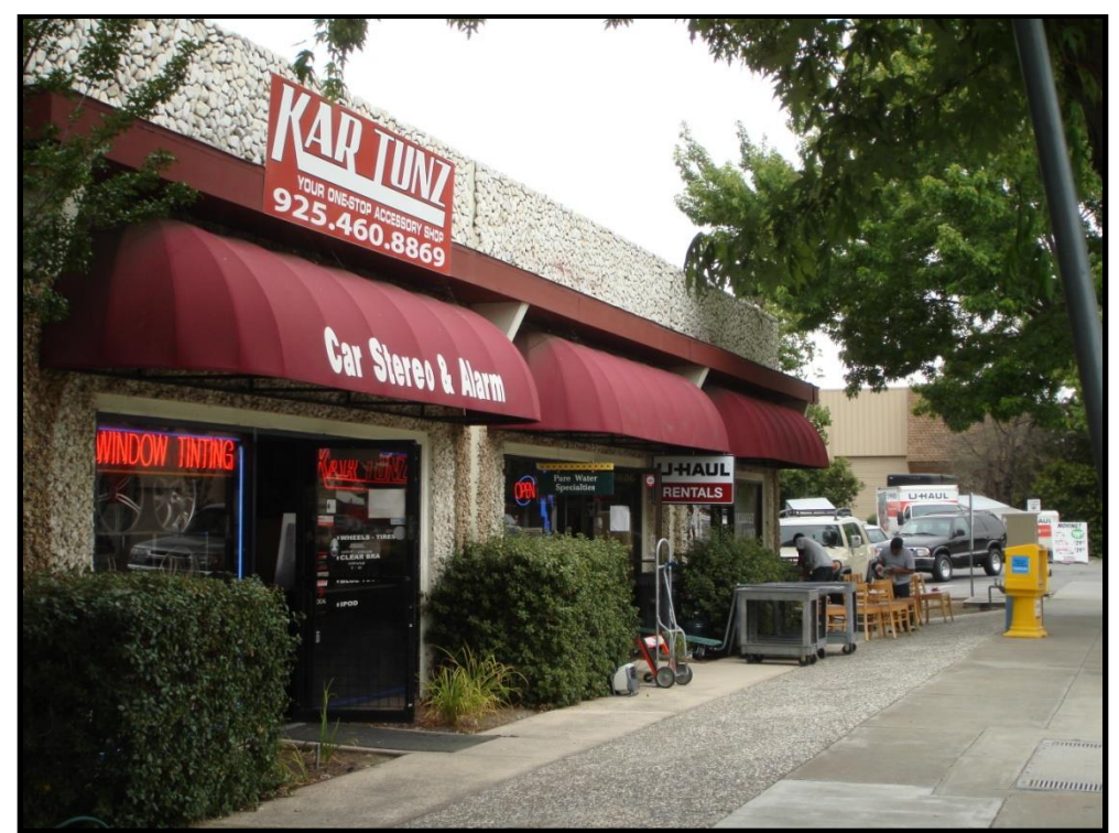
FIGURE 2: Photograph of front of building