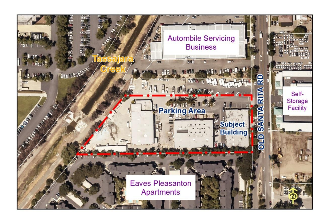
FIGURE 1: Aerial Map of Subject Site and Surrounding Properties

Figure 2 on the following page shows a photograph of the subject building. Other businesses within the same building include a restaurant, a U-Haul business and the car stereo installation, repair, accessories and detailing shop (where the proposed use would be colocated). A swimming pool contractor and plumbing service business are located in the building behind the subject building.