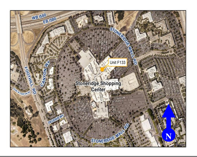
Figure 1.1: Site plan

other offices, hotel, medical, restaurants, retail stores, the Stoneridge Apartments, and the West Dublin/Pleasanton BART station.