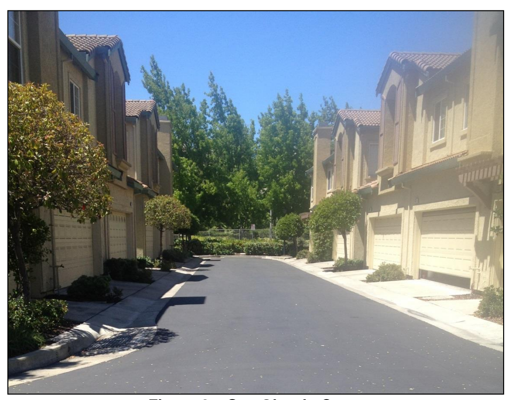
Figure 2 – San Giorgio Court

The application narrative indicated that the majority of the children lived within walking distance and would not create additional traffic hazards within the neighborhood. However, on June 25 between the hours of 8:30 a.m. to 9:30 a.m. staff observed five children being dropped off: two who walked with their guardians, two whose guardians parked in guest stalls and walked them to the door, and one whose guardian parked illegally in the fire lane in front of a garage and walked their child to the door. The increased traffic and the lack of accessible parking with direct access to the home creates a traffic hazard while loading, unloading, or transitioning children to the home while illegally parked along San Giorgio Court. This traffic hazard and increase in traffic is further exacerbated by the site design of the townhouse development and the location of the subject parcel on a narrow dead-end private street with limited visibility and no viable on-site parking during peak a.m. and p.m. drop-off and pick-up times as shown in Figure 2.