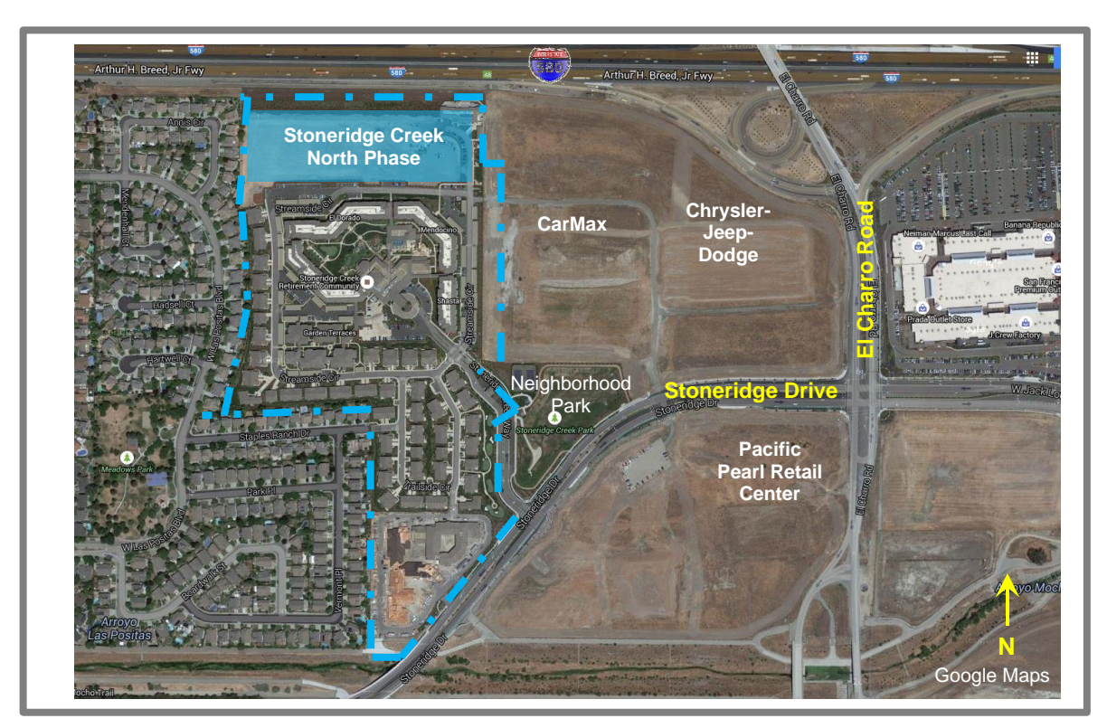
Figure 2: Staples Ranch Aerial Photograph

Stoneridge Creek's site is outlined in blue in Figure 2, and is currently developed with the Health Center, Villa units, Garden Terrace units, ILUs, a clubhouse, and site amenities. The proposed "north phase" entails development of the approximate northern 10 acres of the site.