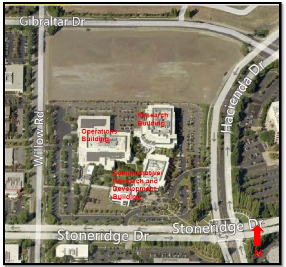
Figure 1: Existing Roche Campus