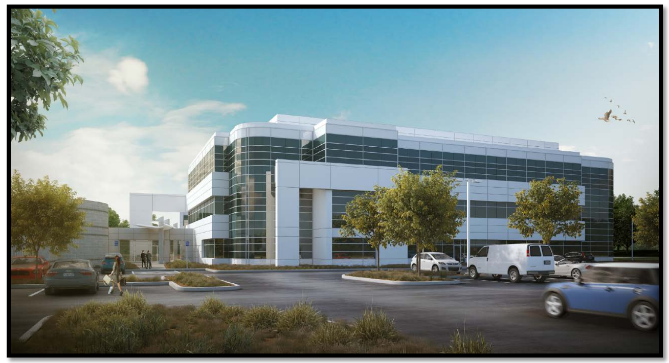
Figure 3: View from the Northwest of the Proposed Building

accents, green reflective glass, green and white spandrel glass, and smooth and split face masonry columns and wall elements. Off-white stucco wall panels would also be utilized as the roof screen material. Pedestrian entrances seen from the courtyard and parking lot would have green tinted glass. Figures 3 and 4 below show perspectives of the proposed building.