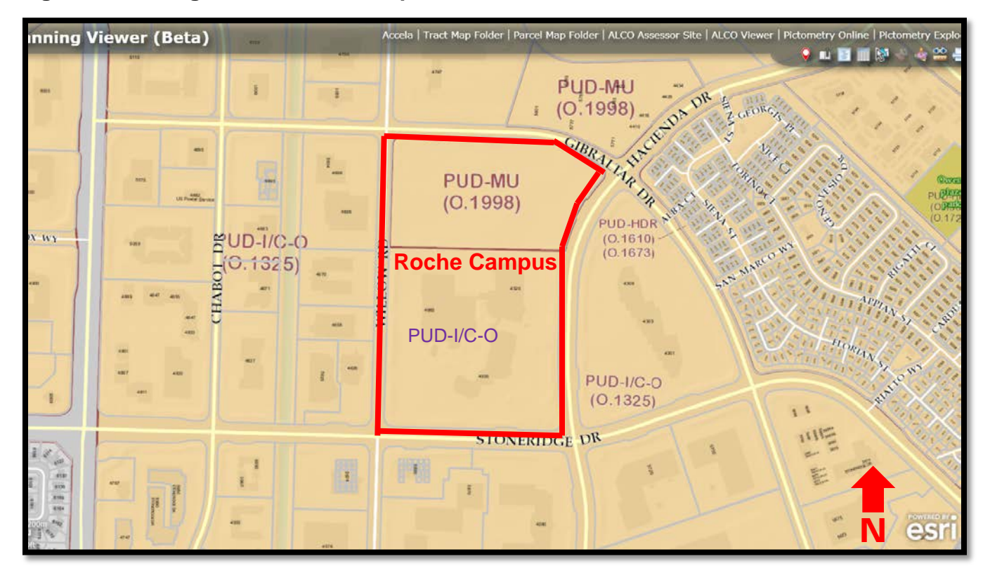
Figure 2: Zoning of the Roche Campus

In 2009, the City Council approved a City-initiated rezoning (Case No. PRZ-48) of three sites in Hacienda to allow for mixed use development, including housing with a density of more than 30 units per acre. The rezoning included an approximately 12.4-acre portion of the Roche Campus. The PUD-Mixed-Use zoned portion of the Roche Campus as shown on Figure 2 below is located south of Gibraltar Drive between Willow Road and Hacienda Drive. The PUD-Mixed-Use zoning allows for the development of office, light manufacturing, research and development, and residential uses.