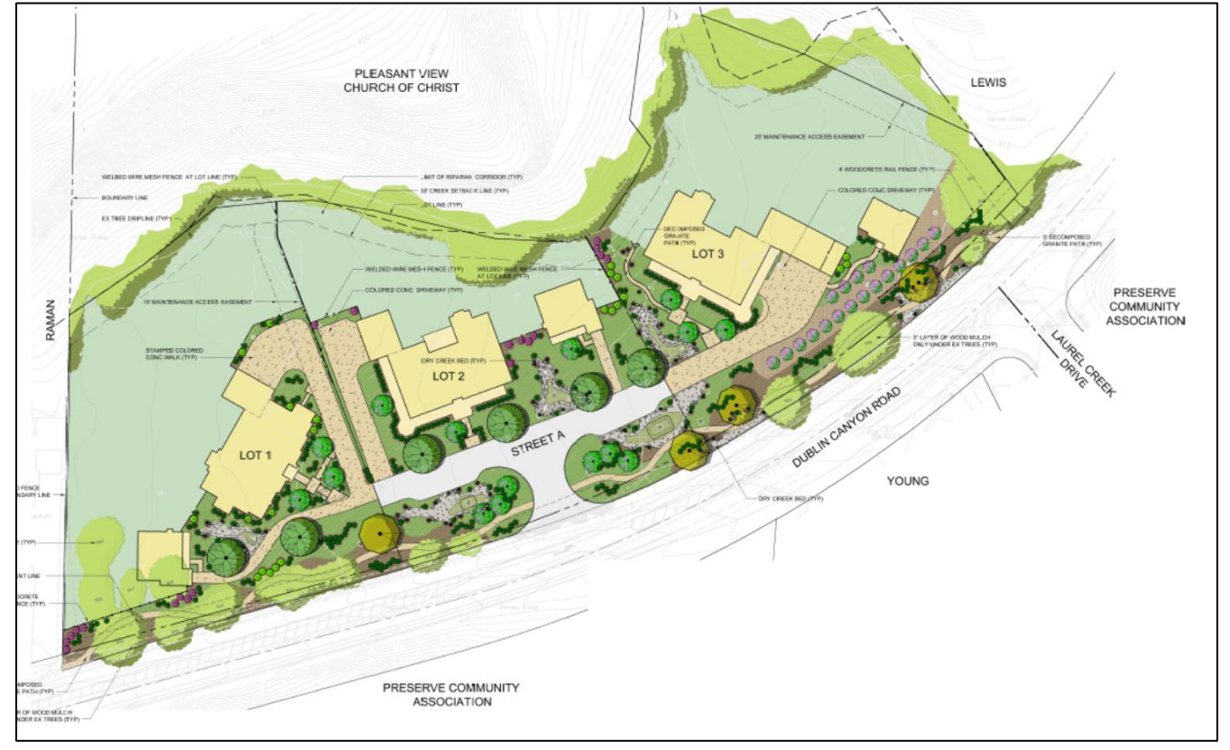
Figure 2: Proposed Site Plan

The proposed homes are all one story and are designed in a variation of Craftsman and Modern French Country style. The home on Lot 1 would be approximately 4,474 square feet in area. The homes on Lots 2 and 3 would be approximately 4,552 square feet in area. Lots 1 and 2 would each have an attached three-car garage while Lot 3 would have a three-car