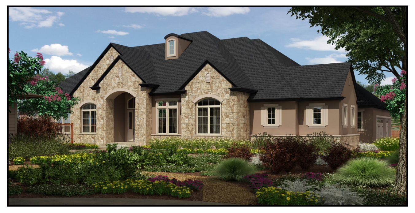
Figure 3b: Front of Home on Lot 2