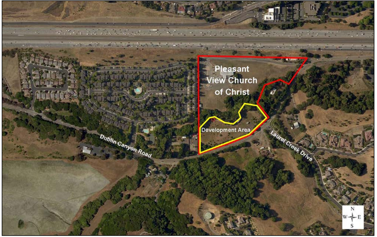
Figure 1: Vicinity Map

From a high point of approximately 480 feet in elevation where the church building is located, the property drops steeply down towards the creek and flattens out along Dublin Canyon Road at approximately 420 feet in elevation. The 4.3-acre area of the site proposed to be developed with homes, shown in Figure 1, is located south of the existing creek and north of Dublin Canyon Road. It currently contains a barn, corral, and a well.