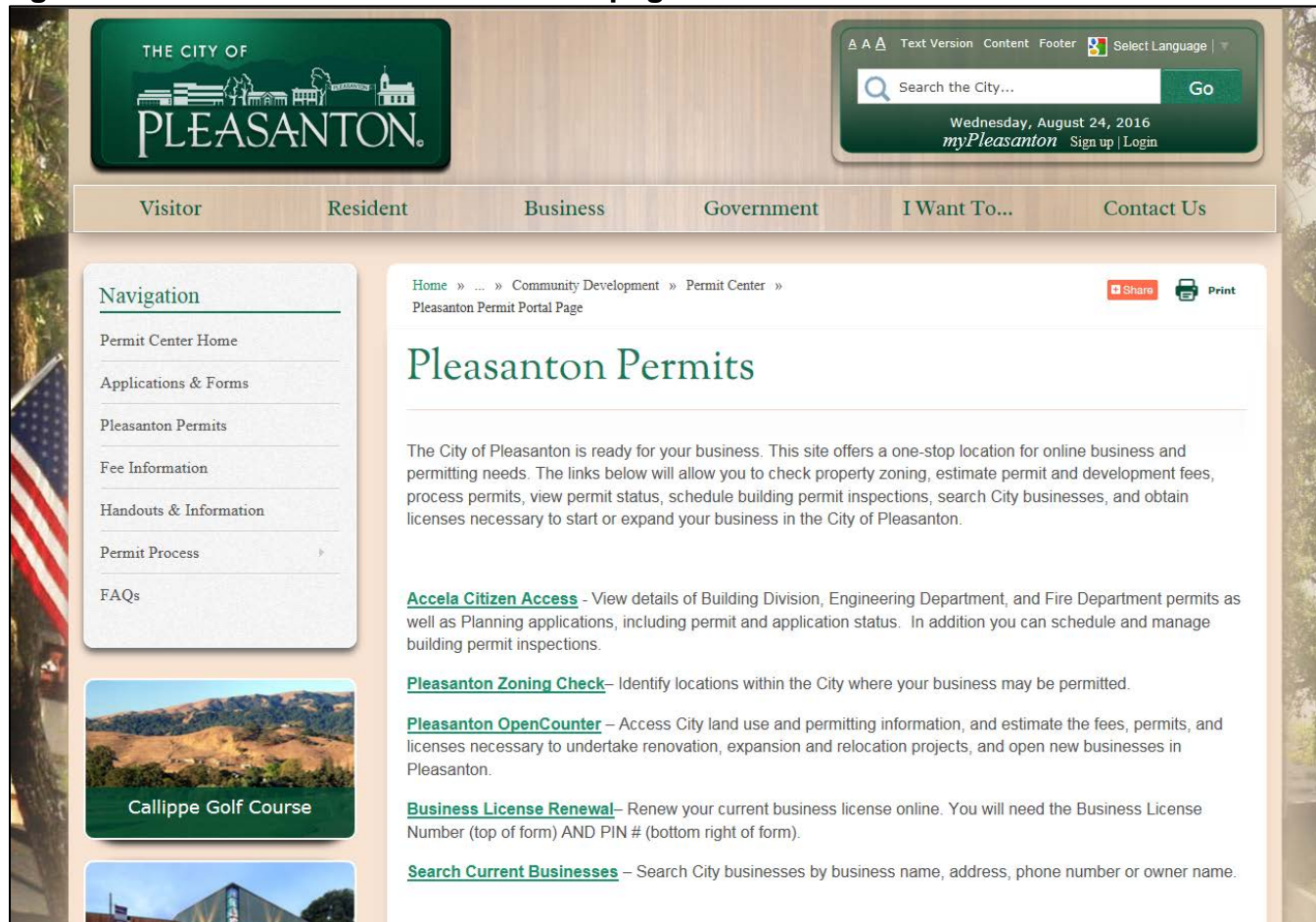
Figure 1 – PleasantonPermits.com Homepage

The new portal (accessed via PleasantonPermits.com) provides links that will help business applicants check property zoning, estimate permit and development fees, process permits, search City businesses, and obtain licenses necessary to start or expand businesses. As well as facilitating the permitting process, the new OpenCounter online tools: