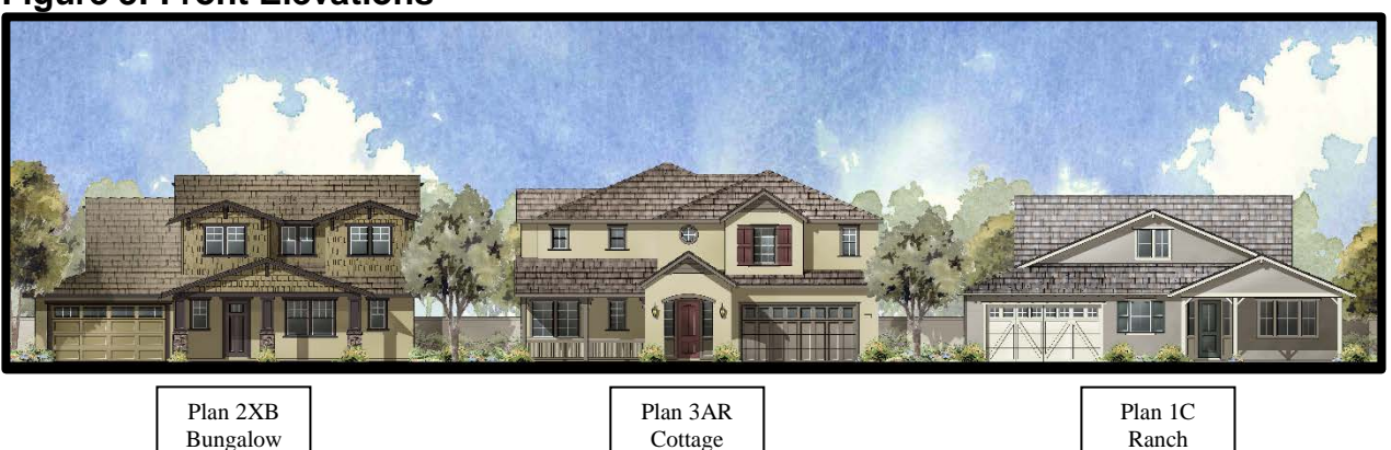
Figure 3: Front Elevations

The five home model types would range in size from 2,451-square-feet to 3,387-square feet. The Plan 1 and Plan 2 one-story homes would range in height from 20 feet, 9 inches to 23 feet, 9 inches (measured from finished grade to the top of the ridge). The Plan 1X and Plan 2X one-story homes with an optional upper floor would range in height from 25 feet, 3 inches to 27 feet, 10 inches. The Plan 3 two-story homes would range in height from 27 feet to 29 feet. Using the Pleasanton Municipal Code (PMC) definition for height (measured vertically from the average elevation of the natural grade of the ground covered by the home to the mean height between eaves and ridges for a gable roof), the homes would range in height from 16 feet, 1 inch to 24 feet, 1 inch. The applicant is proposing to comply with the development standards of the R-1-6,500 Zoning District. Please see Table 1 (Development Standards) below for the other primary development parameters of the proposed project.