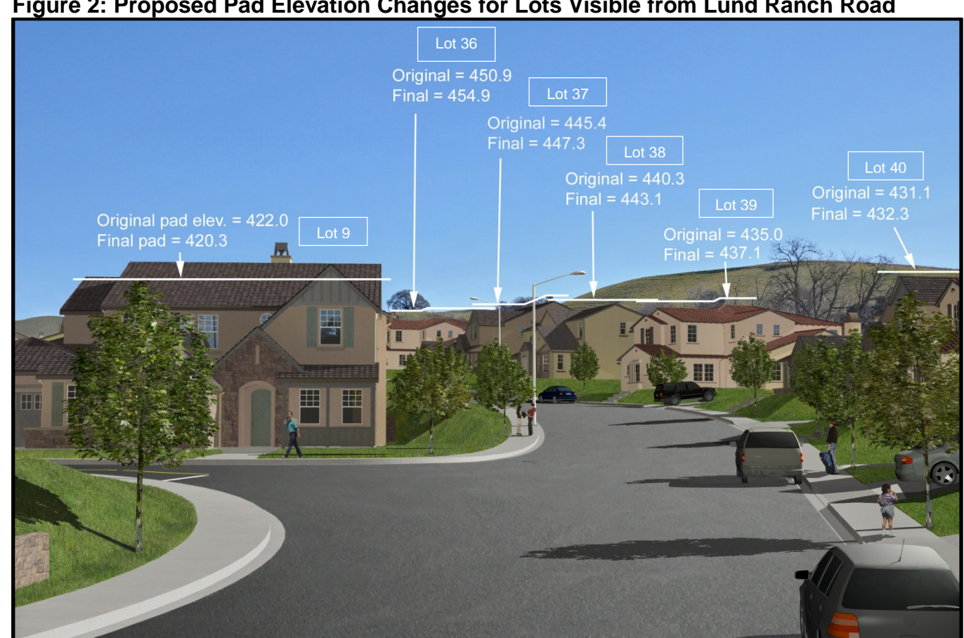
Figure 2: Proposed Pad Elevation Changes for Lots Visible from Lund Ranch Road