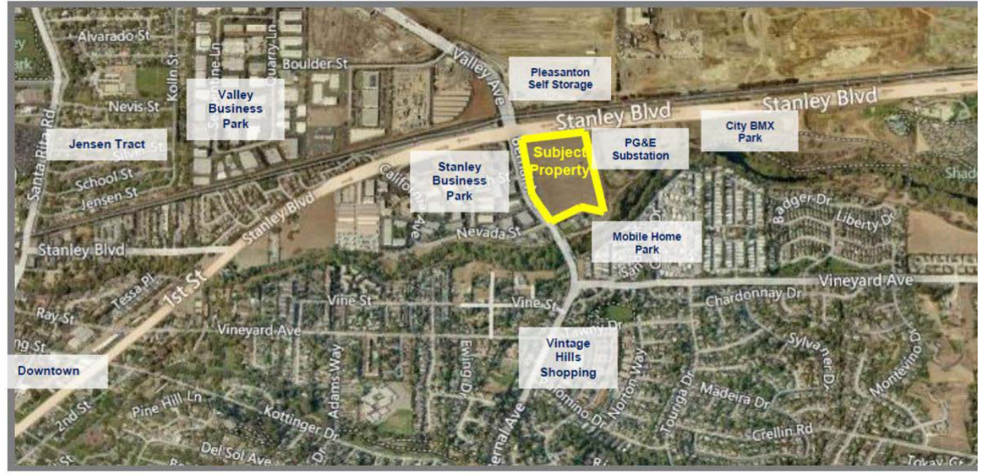
Figure 2: Vicinity Map

The subject property is located southeast of the intersection of Stanley Boulevard and Bernal Avenue. The site comprises approximately 16 acres; the zoning designation for the residential portion of the site (11.5 acres) is PUD-HDR and the remaining 4.5 acres are zoned PUD-C. Figure 2 is the vicinity map showing the location of the center and Figure 3 is a site plan of the commercial center showing the proposed restaurant in the Vintage shopping center.