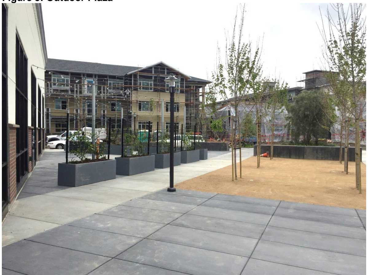
Figure 5: Outdoor Plaza