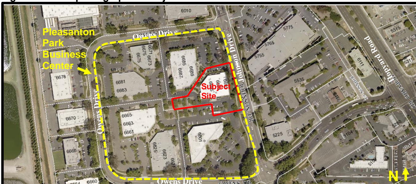
Figure 1: Aerial photograph of subject site

Primary access to the site is provided by two shared driveways from Johnson Drive; however, the subject site is accessible by multiple shared secondary driveways from the Owens Drive loop that serve as primary access for the other buildings within the larger office complex. There are a total of 63 shared on-site parking spaces within the subject site.