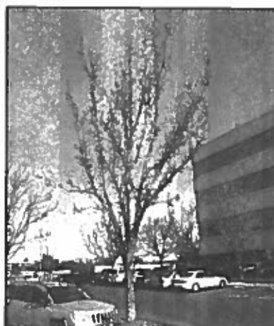
Photo 5: Gallery pear demonstrating epicormic growth and multiple attachments at six feet.