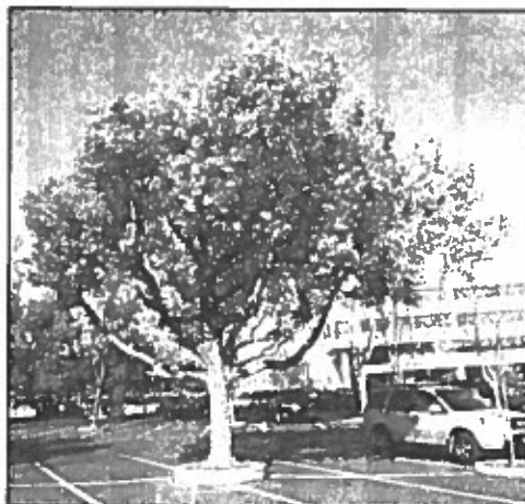
Photo 4: Camphors typically had spreading crowns but had been planted in small parking lot islands.

Thirty (30) European white birches were present on the site. The birches were primarily in fair condition (22 trees), with 7 in good condition and one (1) in poor. They were generally young, ranging in from 6 to 13" in diameter with an average of 9". Many of the birches were leaning, crowded and suffering from twig dieback, indicative of drought stress (Photo 6, following page).