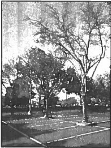
Photo 1: Raywood ashes demonstrating multiple attachment form and small island growing space typical of this site.