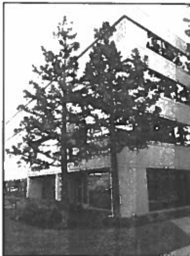
Photo 2: Coast redwoods on site tended to have thin canopies and be pruned up to 15 feet.