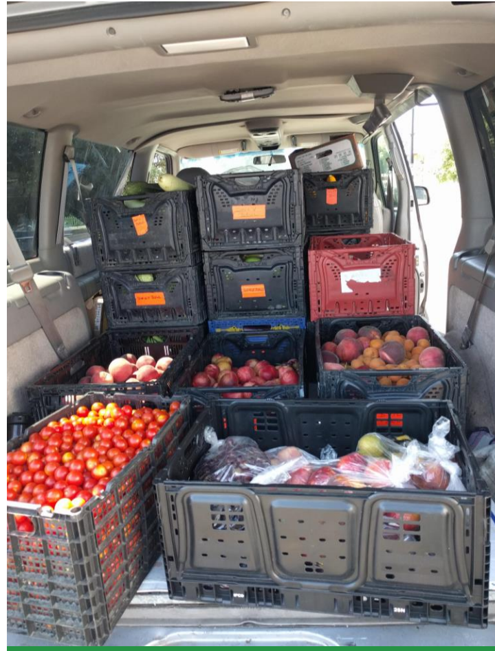
Grant funding to help food recovery organizations rescue edible food