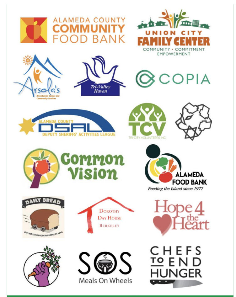
Connecting orgs through Alameda County Food Recovery Network