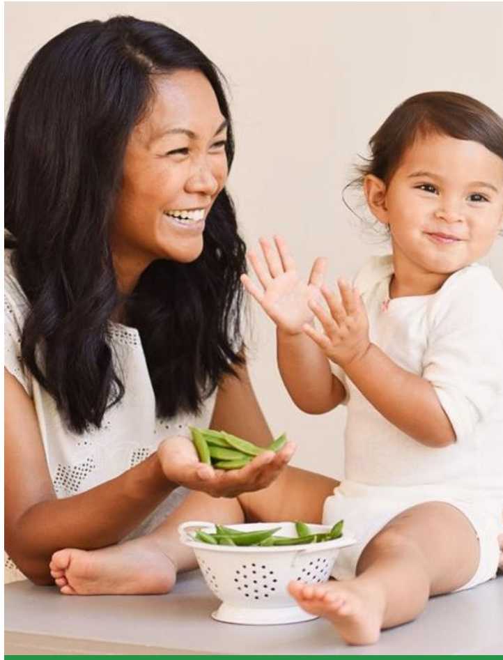
Stop Food Waste campaign to prevent food waste at home, at school, at work