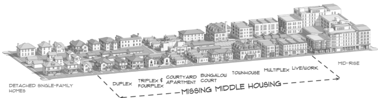
Figure 2: Examples of Missing Middle Housing

A concept related to affordability by design is referred to as, “missing middle housing.” This term typically refers to housing that has a scale and form more similar to traditional single-family housing, but includes smaller and more compact units; examples include duplexes, triplexes, townhomes, courtyard-style homes, as shown in Figure 2, excerpted from Exhibit E. A key concept of missing middle housing is to allow for “house-scale” buildings with multiple units in areas of the jurisdiction where infill is appropriate. Some examples in Pleasanton of missing middle housing include the older housing stock seen downtown, with multiple units in a single building, constructed prior to the traditional single-family neighborhoods found outside of downtown. Some of the more recent projects that include attached housing types such as townhomes also provide examples of missing middle housing; although prices of these homes are high, they are relatively more affordable than new, detached single-family homes built in the same timeframe.