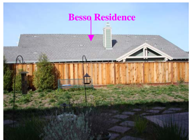
Figure 3: Rear Yard View from Spencer Backyard