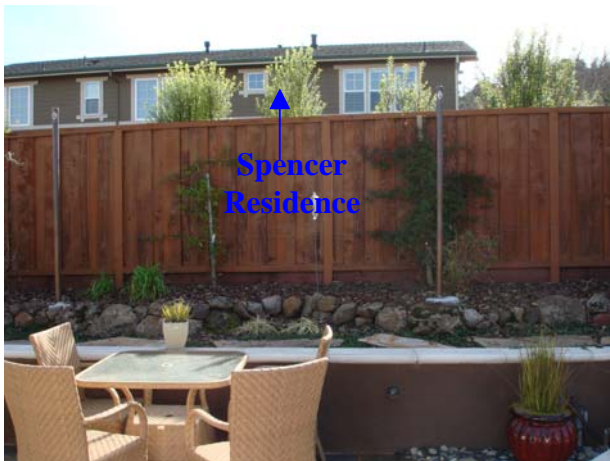
Figure 2: Rear Yard View from Besso Backyard