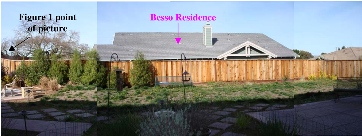
Figure 4: Rear Yard View towards Besso Residence