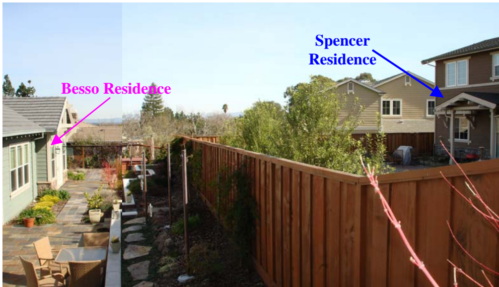
Figure 1: Besso and Spencer Shared Rear Property Line

The subject site is a relatively flat lot that is elevated approximately 3 to 4-feet (from finished house pad to finished house pad) higher the house located directly behind it (4538 River Rock Hill Road, Mr. Besso's lot, and 4526 River Rock Hill Road) with the adjacent neighbor to the subject site, 8015 Oak Creek Drive, terraced lower and 8001 Oak Creek Drive below that. The same terracing topography applies to the southern side of the development with houses located farther from Foothill being higher and adjoining lots being lower.