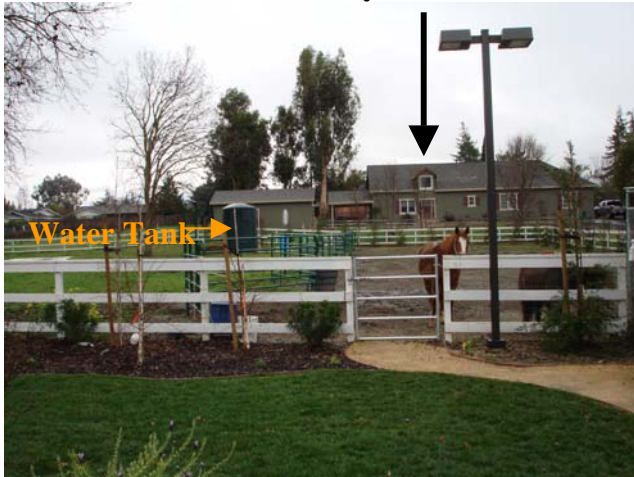
View towards 455 Sycamore Road