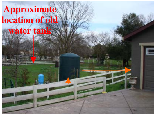
View from 455 Sycamore Roads front door