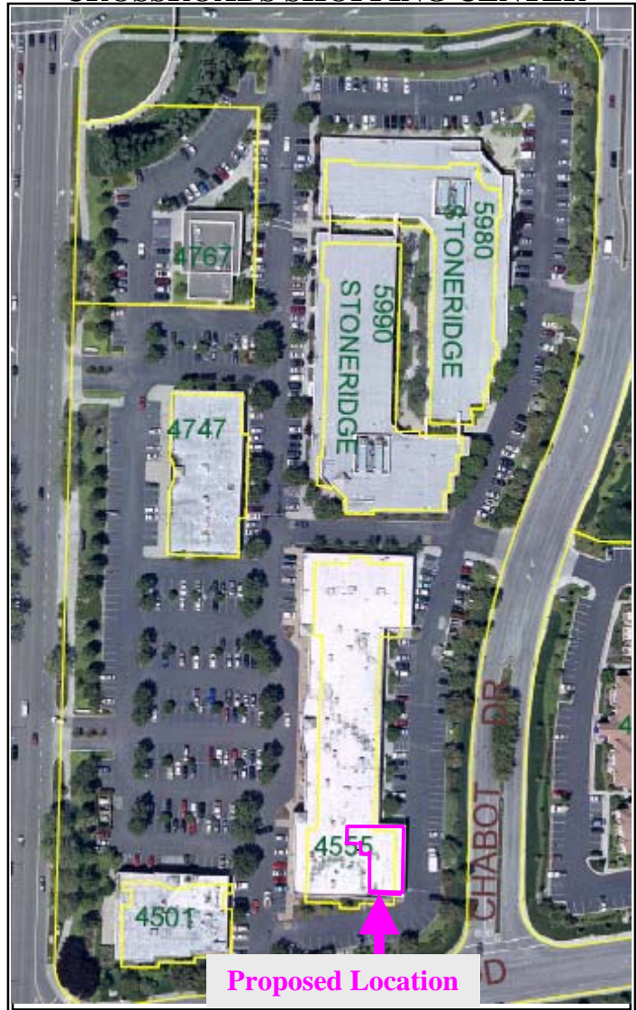
CROSSROADS SHOPPING CENTER