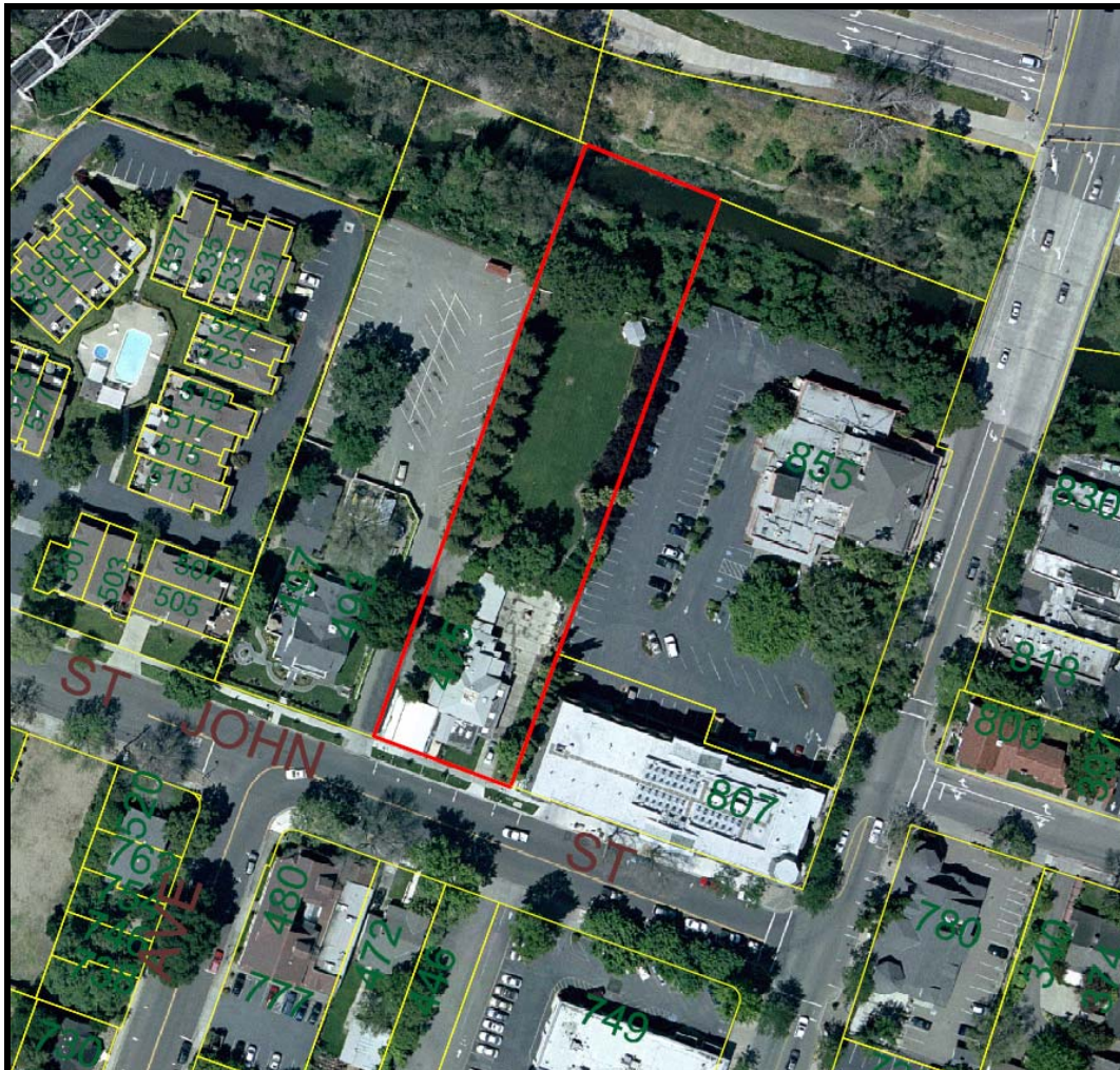
Figure 1, 2005 aerial photograph of the site and surrounding area

John Street. The Pleasanton Hotel and Rose Hotel are located to the east of the subject property. The Arroyo Del Valle borders the site to the north. The aerial photograph below (Figure 1) shows the project site (outlined in red) and the adjoining land uses.