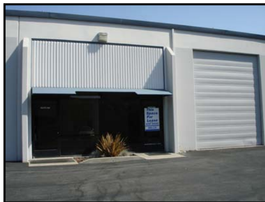
Photo of Suite 209, showing main entrance and roll-up door