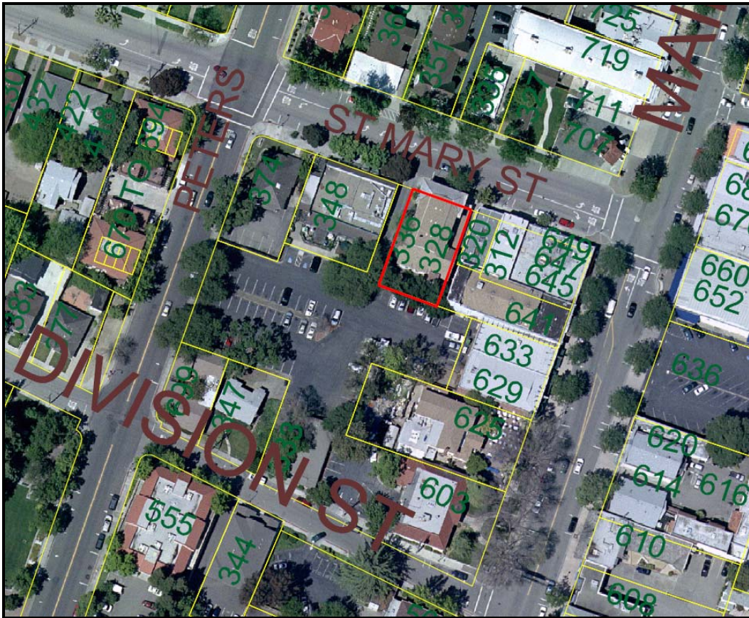
Figure 1, 2005 Aerial Photograph of the Site and Surrounding Area

The subject property is located on the south side of St. Mary Street and contains an approximately 7,685-square-foot, two-story building. Redcoats British Pub and Restaurant is located in the approximately 3,172-square-foot first floor tenant space. The approximately 3,981-square-foot second floor is currently unoccupied. The property is bordered on the south by a 72-space City parking lot, on the west by Fernando's Restaurant, and on the east by the 320 St. Mary Street (State Farm Insurance) and 641 Main Street (Wine Steward) buildings. Commercial buildings are located to the north, across St. Mary Street. The nearest residence is located approximately 30 feet to the east on the second floor of the 312 St. Mary Street building (Al's Hair Design is on the first floor). This second floor residence was constructed in 2005-06. Other residences are located at 363 St. Mary Street (behind a doctor's office) and on the west side of Peters Avenue. Two driveways on Peters Avenue lead to the City parking lot behind the building. The aerial photograph below (Figure 1) shows the project site (outlined in red) and the adjoining land uses.