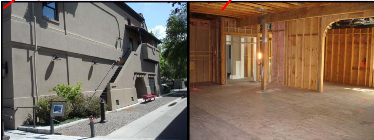
Figure 2, Upper Floor Plan and Photographs