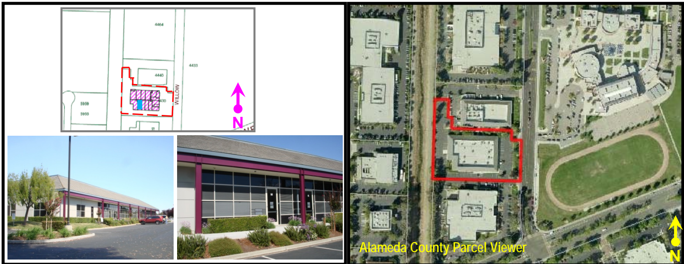
FIGURE 1: VICINITY MAP, PHOTOS AND AERIAL PHOTOGRAPH OF SUBJECT PROPERTY

The site is located within Hacienda Business Park, near the intersection of Willow Road and West Las Positas Boulevard. Commercial buildings are located to the north and south of the subject site and are also located across the Chabot Canal to the west. Thomas Hart Middle School is located across Willow Road to the east. Figure 1 below shows a vicinity map, photos, and an aerial view of the area surrounding the subject building. The approximate location of Suite M has been highlighted in turquoise.