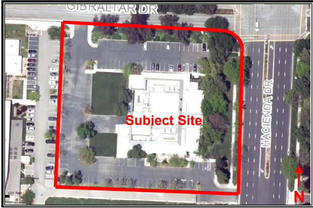
Figure 2: Subject Site