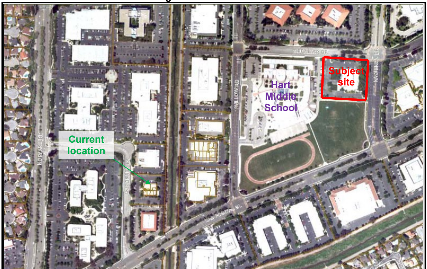
Figure 1: Aerial Photo

Hacienda Park has a mix of uses that include, but are not limited to; professional offices, light manufacturing and industrial uses, and other uses, such as religious facilities, public and private schools, and sports and recreational facilities. The subject building is located east of Hart Middle School, and across the street (north and east) from office related uses. A portion of the subject building is currently being occupied by a medical equipment manufacturer with the applicant proposing to occupy the remaining portion of the building.