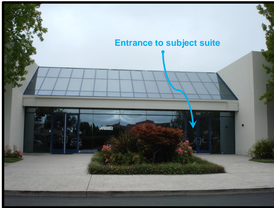
FIGURE 2: Photograph of subject building

The site is accessed from two driveways from Willow Road and is approximately 4.6 acres in area. The subject single-story building is approximately 65,628 square feet in size and the subject suite is approximately 10,029 square feet in size. The building currently consists of 3 suites and serves as locations for companies including Sub-One Technology and Anixter, both research and development companies. The building is surrounded by a parking lot on all sides. Figure 2 is a photograph of the subject building.