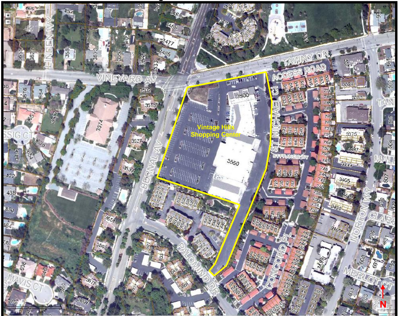
Figure 1: Aerial View