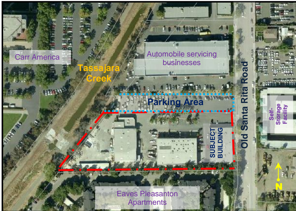
FIGURE 1: Aerial Map of Subject Site and Surrounding Properties

Figures 2 and 3 on the following page show photographs of the subject building and of the parking area for the rental vehicles.