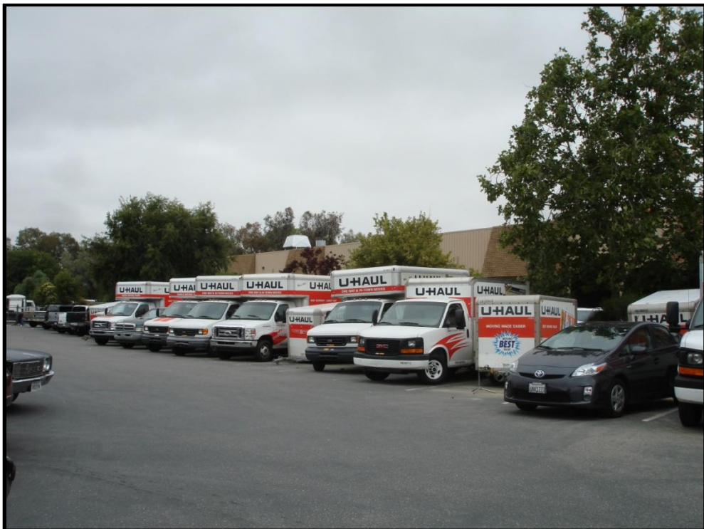
FIGURE 3: Photograph showing parking area