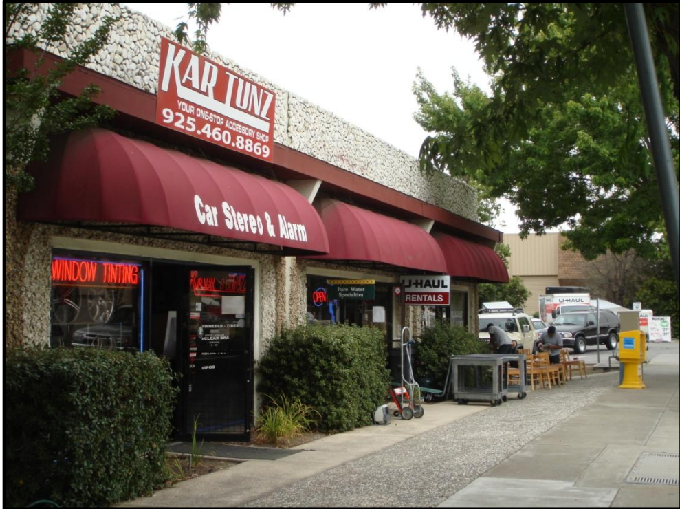
FIGURE 2: Photograph of front of building