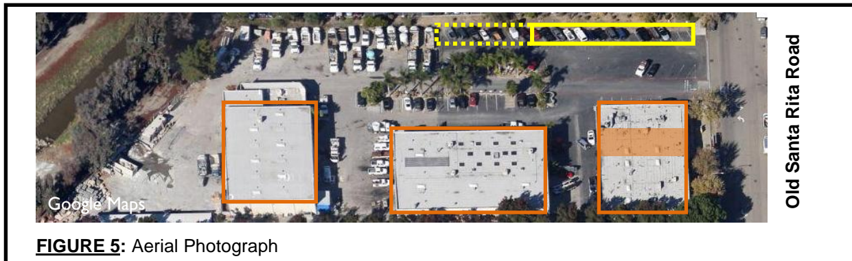
FIGURE 5: Aerial Photograph