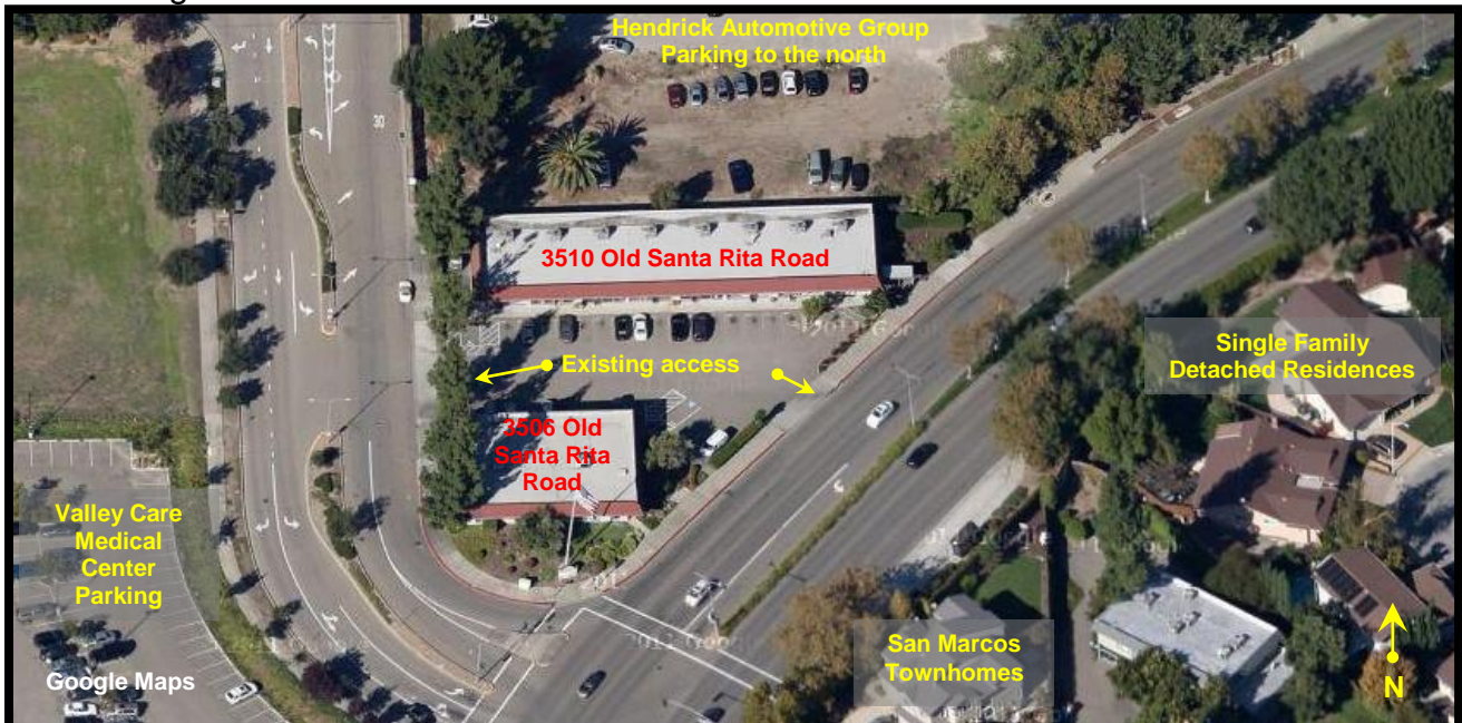
FIGURE 2: Aerial Photograph

The site is bounded by Hendrick Automotive Group’s inventory parking lot to the north, townhomes and single-family detached residences across Santa Rita Road to the east, the signalized intersection of Santa Rita and Old Santa Rita Roads directly to the south, and the Valley Care Medical Center hospital, parking area, and vacant property across Old Santa Rita Road to the west. Figure 2 provides an aerial overview of the subject property and surrounding land uses.