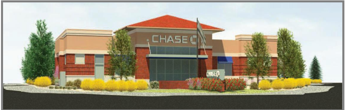
FIGURE 7: 3D Rendering Showing Southern Facade

Figure 7 shows a 3D rendering of the southern (facing the intersection of Santa Rita Road and Old Santa Rita Road) facade; additional 3D renderings are part of Exhibit B.