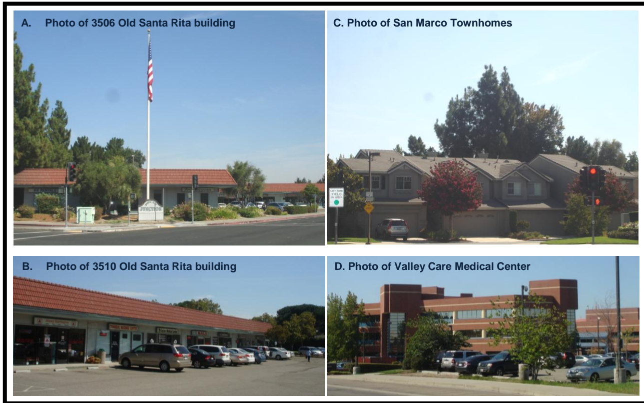
FIGURE 3: Photograph of Project Site and Surrounding Land Uses

Two buildings are located on the subject property, both of which would be demolished. The aggregate total of the two buildings is approximately 11,591-square feet. Various types of businesses are located within these buildings, including: a flower shop, nail salon, photo studio and supply store, medical office, real estate office, and insurance office. Figure 3 shows photographs of these buildings, the San Marco Townhomes, and Valley Care Medical Center.