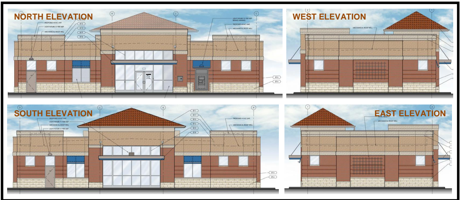
FIGURE 6: Proposed Elevations

Figure 6 shows elevations for the proposed building.