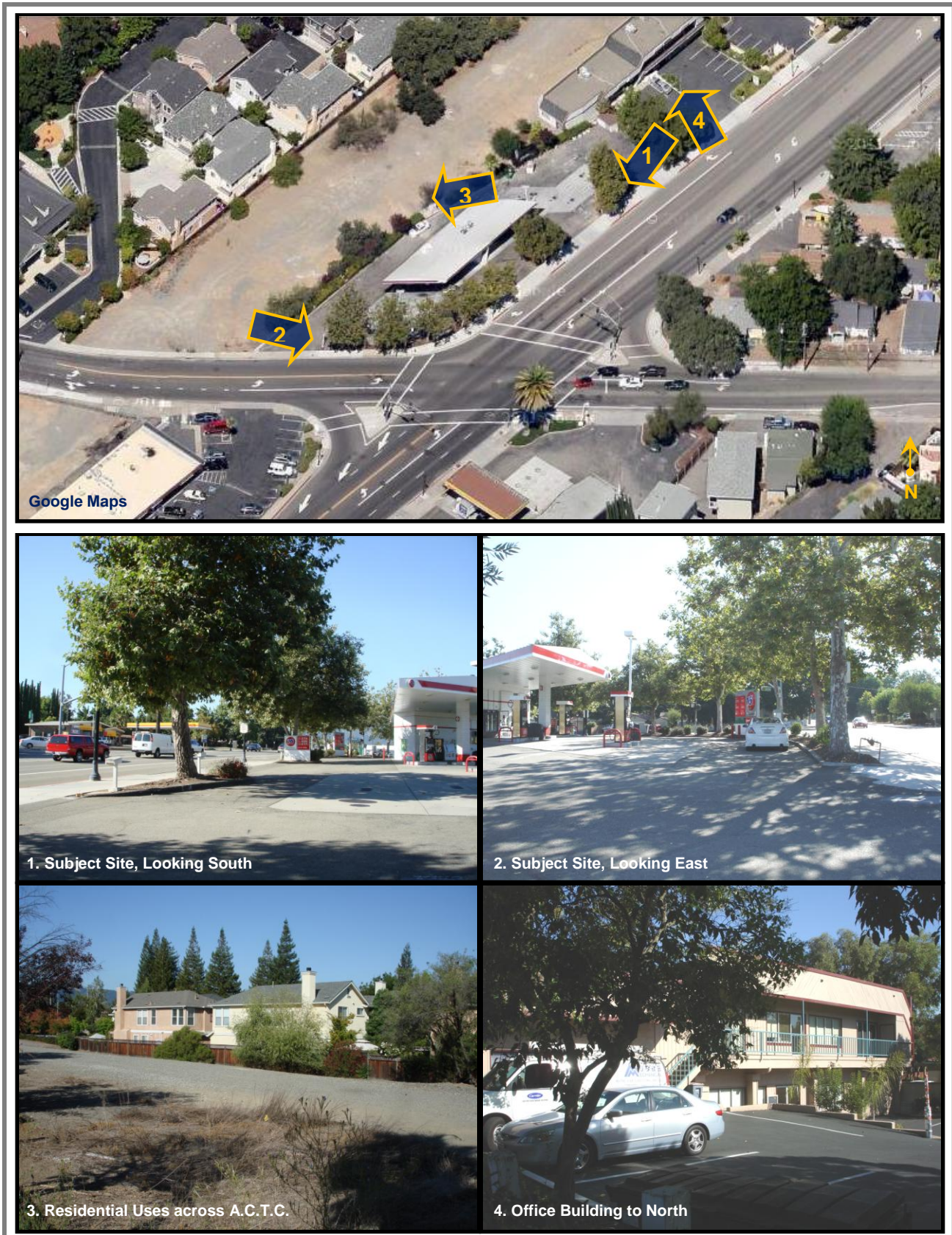
FIGURE 2: Bird's Eye Aerial and Photographs