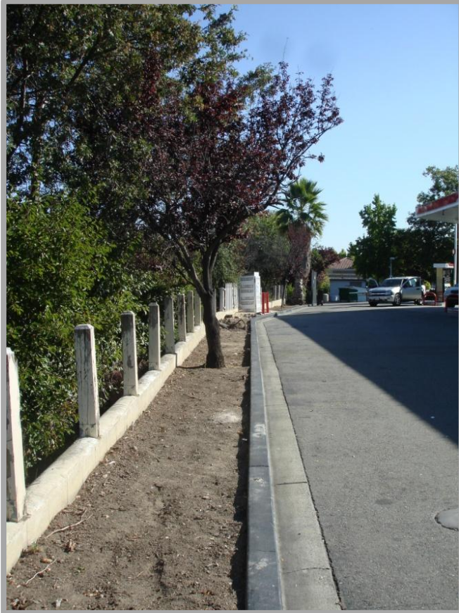
FIGURE 7: Planter area along western property line

construction impacts. Sheet L-1 provides a plan for the proposed landscaping on the site, and shows 15-gallon Sand Cherry (deciduous) shrubs trained to grow into multi-trunk trees in the planter area along the western property line. Shrubs and groundcover in these planter areas include Blue Fescue, Red Leaf Japanese Barberry, Lily-of-the-Nile, Red Fountain Grass, Dwarf Coyote Brush, and rock mulch.