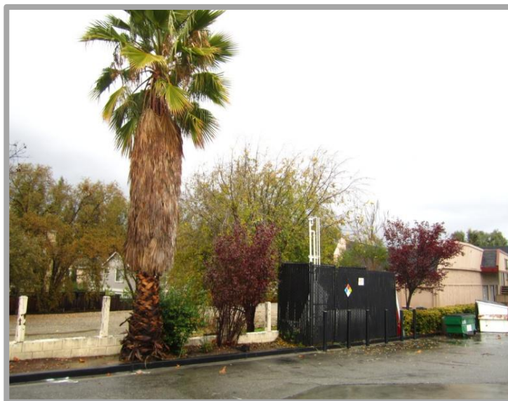
FIGURE 8: Photograph of Existing E.V.R. System

The photograph in Figure 8 shows the existing state-required Enhanced Vapor Recovery (E.V.R.) canister, tank, and vent lines (behind a black chain-link fence).