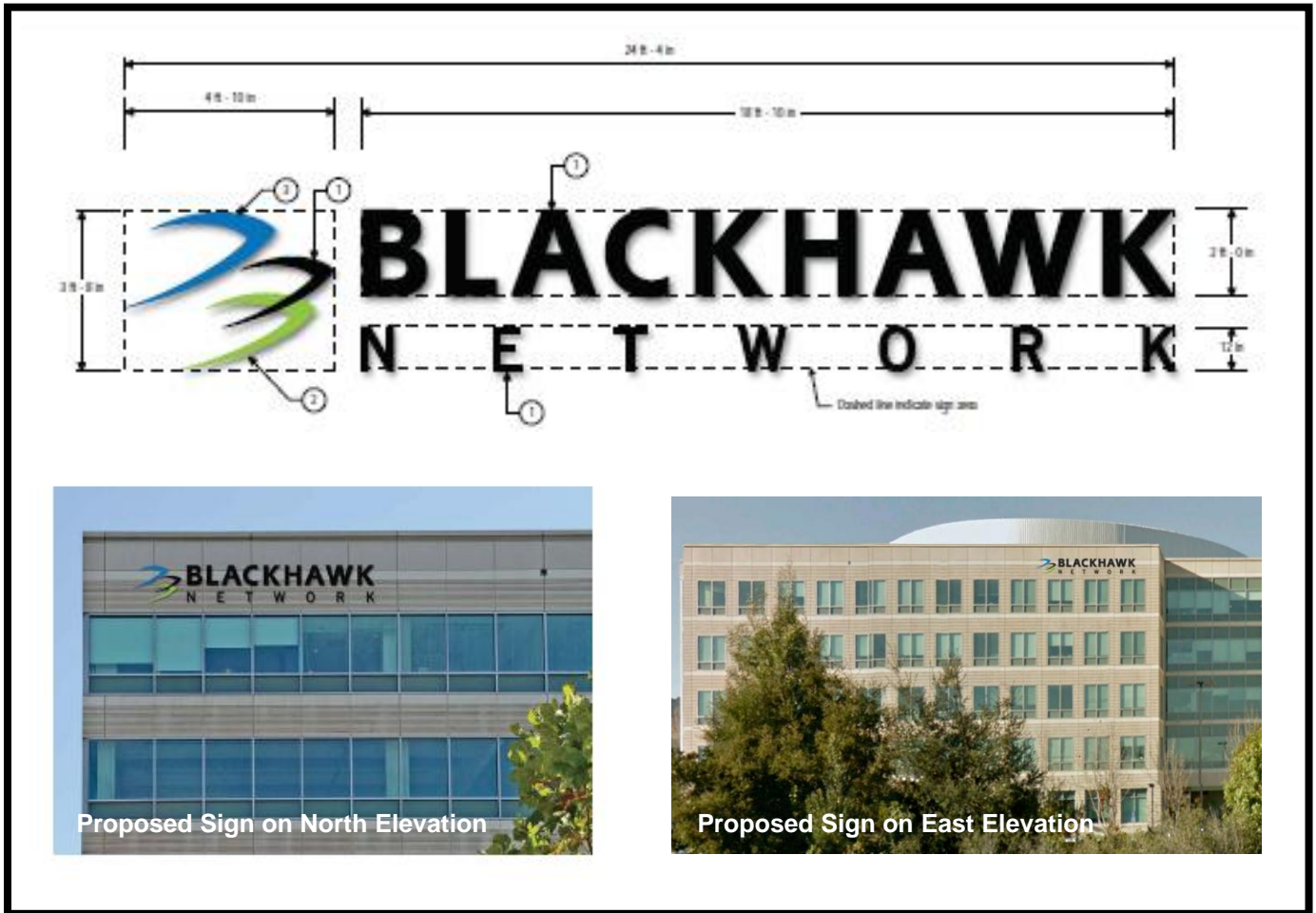
FIGURE 4: Proposed Sign and Elevations

Figure 4 shows the dimensions of the proposed signage and a photo montage of the proposed signs on the building.