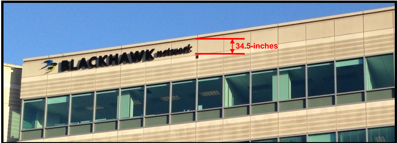
FIGURE 5: Reveal Area

Staff is willing to support an exception to the sign program criteria by allowing a maximum logo height of 44-inches and 5-inch letter depth. However, staff finds that the other deviations from the approved sign program criteria, particularly the internal illumination and the location of the sign where it is not located between the reveal lines of the upper façade, will result in an overall appearance that is inconsistent with the other signs within the development and therefore less attractive.