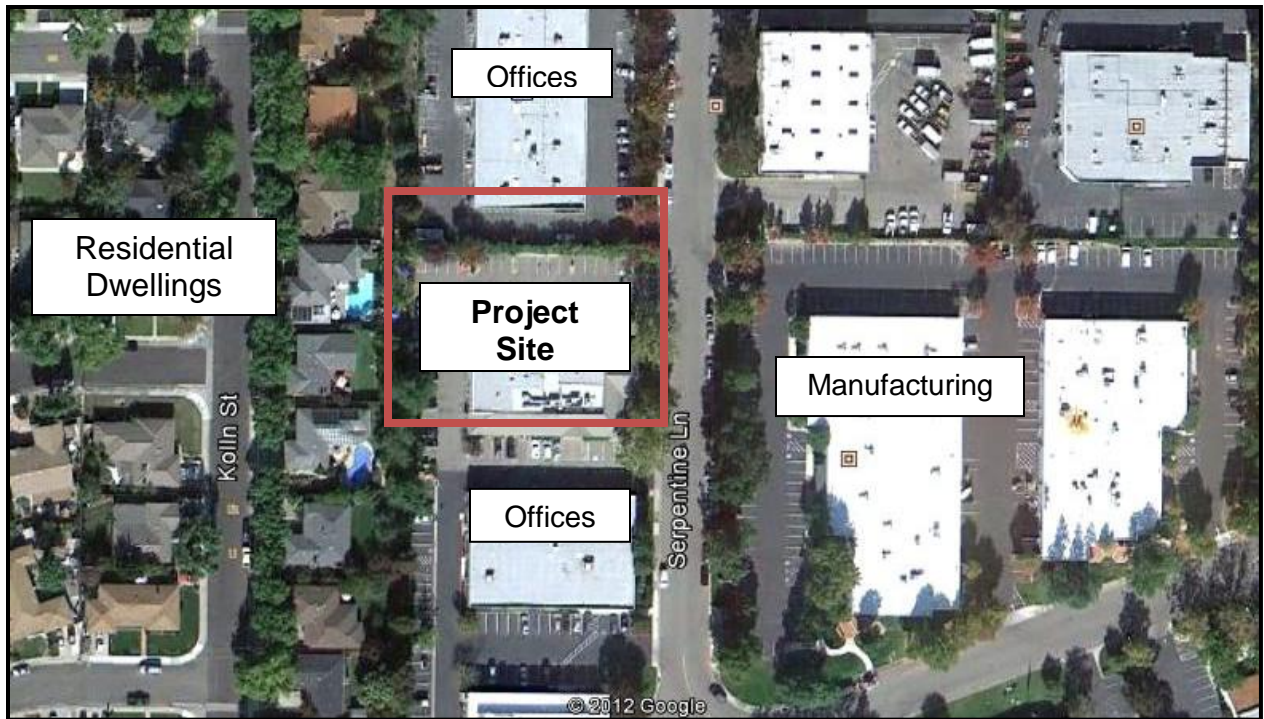
Figure 1: Project Site and Surrounding Location

Valley Business Park has a mix of uses that include, but are not limited to; professional offices, light manufacturing and industrial uses, and other uses, such as religious facilities, private schools, and cheerleader training and other sports and recreational facilities.