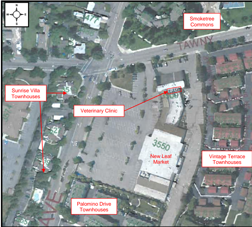
Figure 1: 2005 Aerial Photograph/Location Map of the Vintage Hills Shopping Center with Suite 140.

The Vintage Hills Shopping Center is an approximately 5.07-acre property developed with approximately 49,581 square feet of building floor area and 278 parking spaces. Tenant spaces vary from 620 square feet to 2,124 square feet in area. Public street access to the shopping center is provided by one driveway entrance from Bernal Avenue, two driveway entrances from Tawny Drive, and one driveway entrance from Palomino Drive. All tenant suites are accessed from the parking areas on the north and west sides of the shopping center.