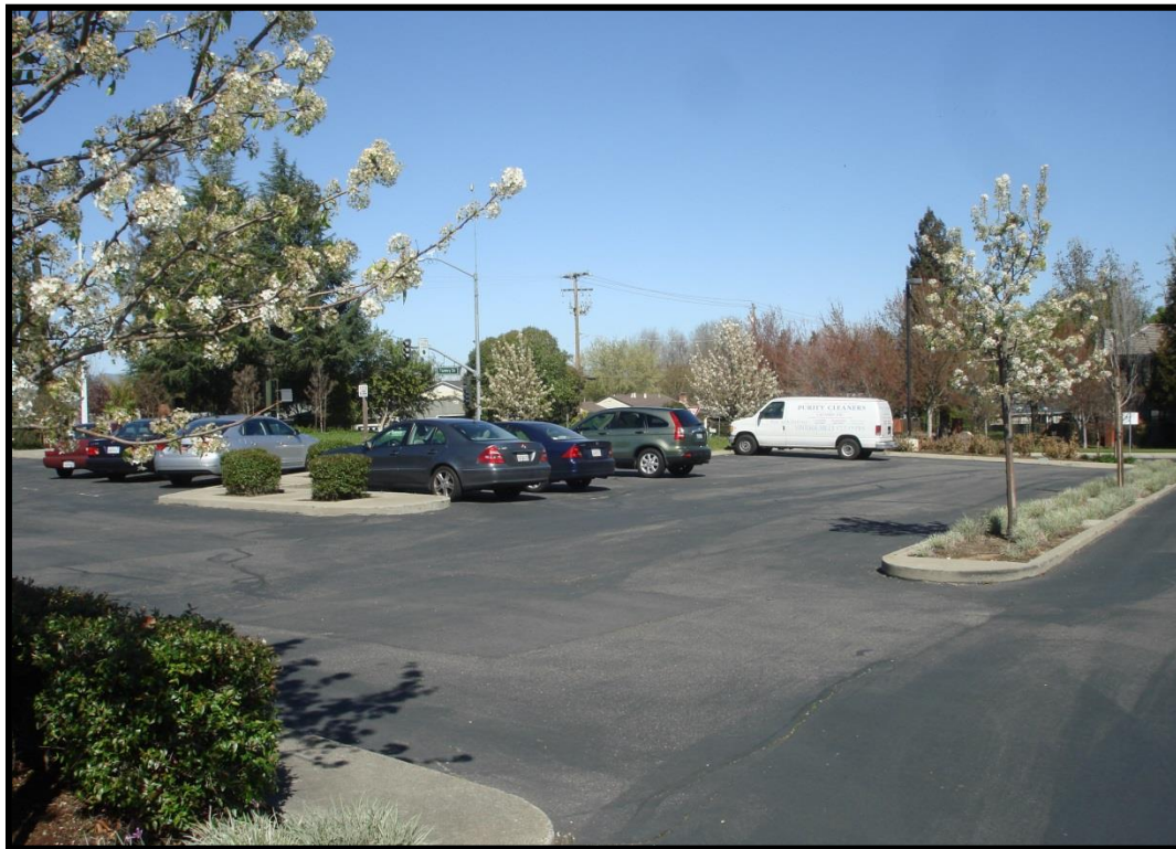
Figure 5: Parking Area Near the Front Entrance to the Proposed Veterinary Clinic – Mid-Afternoon.

Staff visited the subject site mid-morning and mid-afternoon during the weekday and observed that there is ample available parking. Figure 5, below, is a photograph of the portion of the shopping center’s parking area near the front entrance of the veterinary clinic taken mid-afternoon.