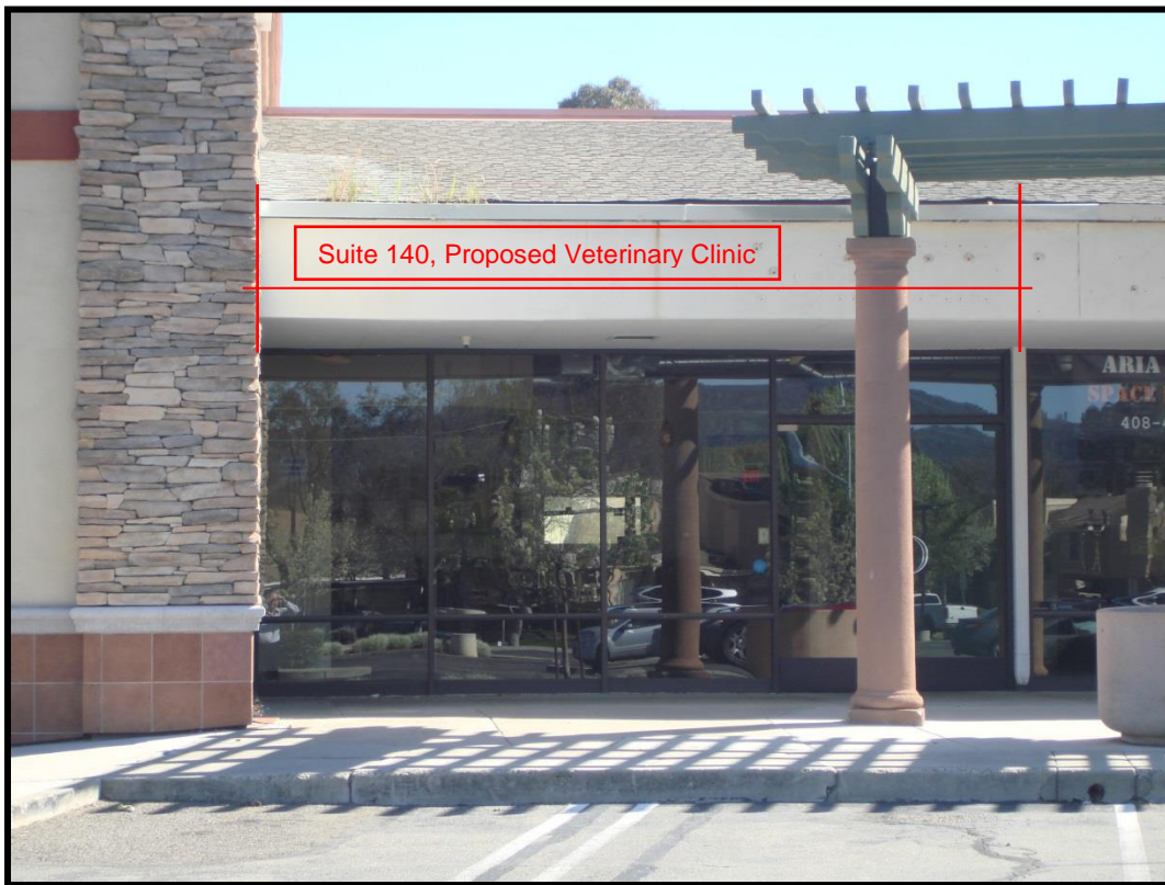
Figure 3: Suite 140 for the Veterinary Clinic.

Figure 3, below, is a photograph of the front elevation of the proposed tenant suite.