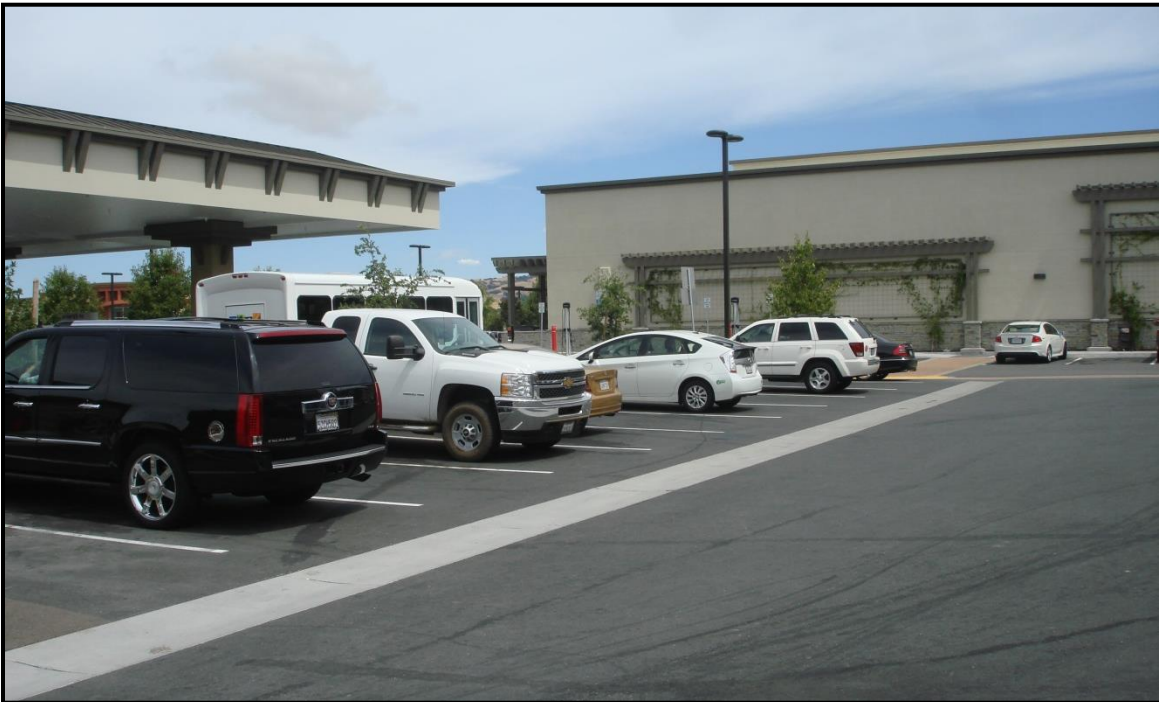
Figure 4: Parking Area in Front of Tenant Suite

Figure 4, below, is a photograph of the parking area in front of the proposed tenant suite.