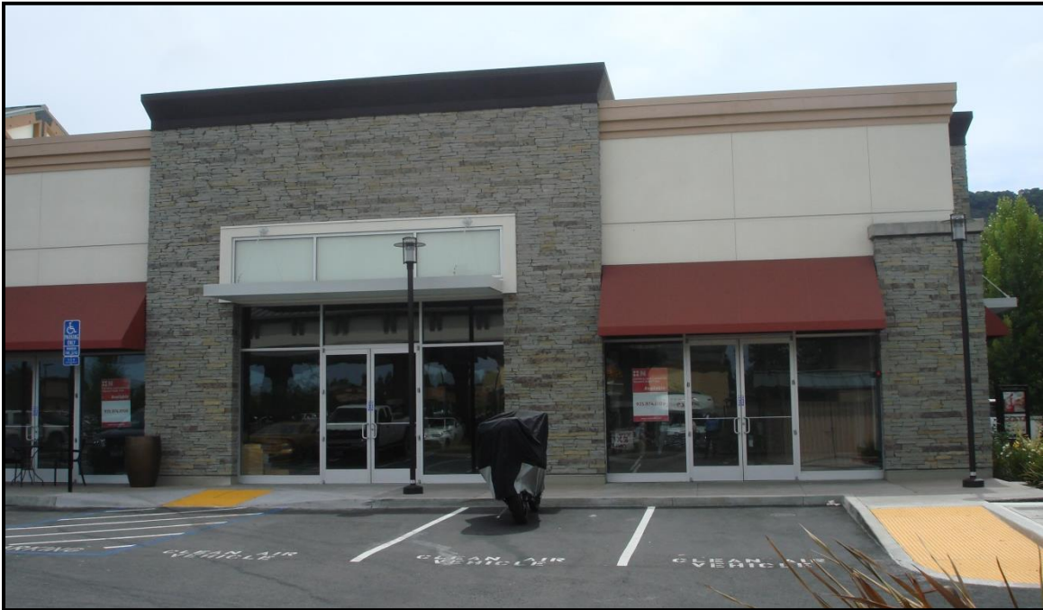
Figure 2: Front Elevation of the Hand and Stone Tenant Suite

Figure 2, below, is a photograph of the front elevation of the proposed tenant suite.