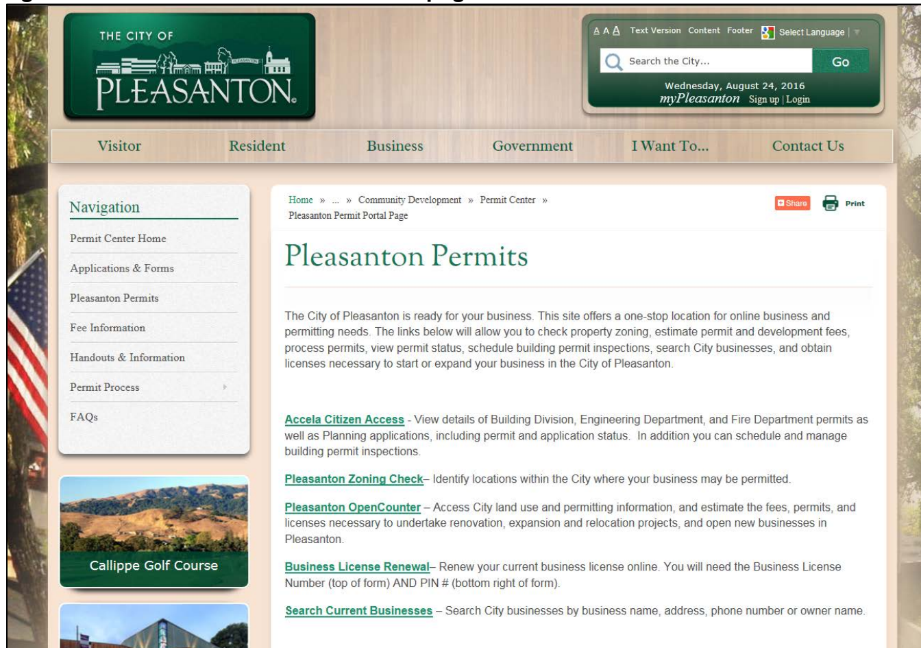
Figure 1 – PleasantonPermits.com Homepage

The new portal (accessed via PleasantonPermits.com) provides links that will help business applicants check property zoning, estimate permit and development fees, process permits, search City businesses, and obtain licenses necessary to start or expand businesses. As well as facilitating the permitting process, the new OpenCounter online tools: